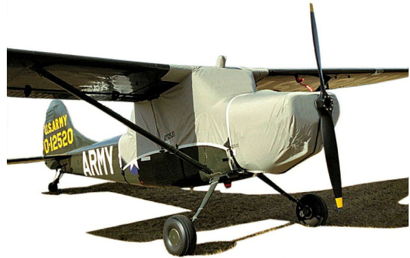
Cessna L-19 Canopy & Engine Covers (similar to Siai Marchetti 1019)