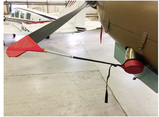
Siai Marchetti 1019 Prop Tie-Exhaust Covers