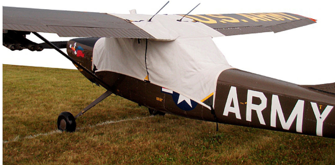
L-19 Canopy Cover (similar to Siai Marchetti 1019)

This cover type is made from Silver Acrylic Sunbrella canvas and is 100% lined with a soft and smooth microfiber. Bruce's Custom Covers developed this material combination especially for aircraft protection. The outer material is medium weight and treated for water resistance, UV resistance and anti-static buildup. The inner lining is a very soft and smooth microfiber to prevent scratching. The material is very reflective, and tests show that the cabin interior temperature can be reduced to near-ambient temperature on the hottest of days. It is water, ice and snow repellent, yet breathable to allow moisture to escape from between the cover and the aircraft surface.