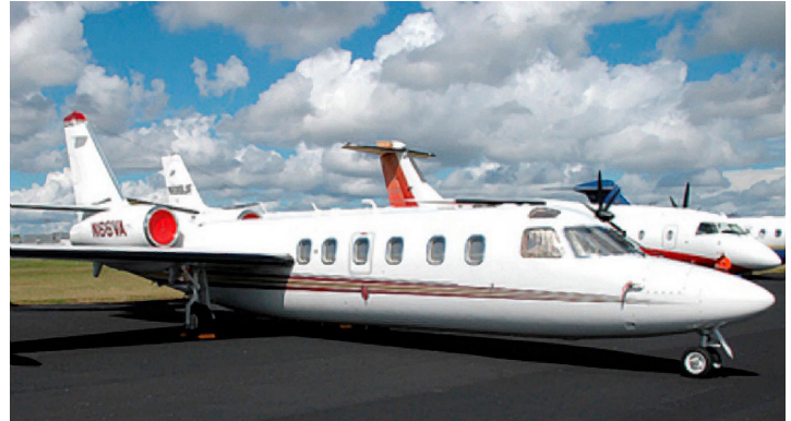
Westwind Engine Intake Plugs