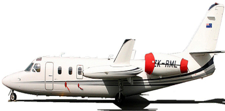
Jet Commander Engine Covers

The Israel Aircraft Industries Jet Commander 1121 Bikini Style Engine Covers are a single-piece design using a soft and smooth stretchy fabric. The cover stretches tightly over both the intake and exhaust, installing quickly and easily. These covers are designed to be used as hangar dust covers and have a useful life of approximately one year.