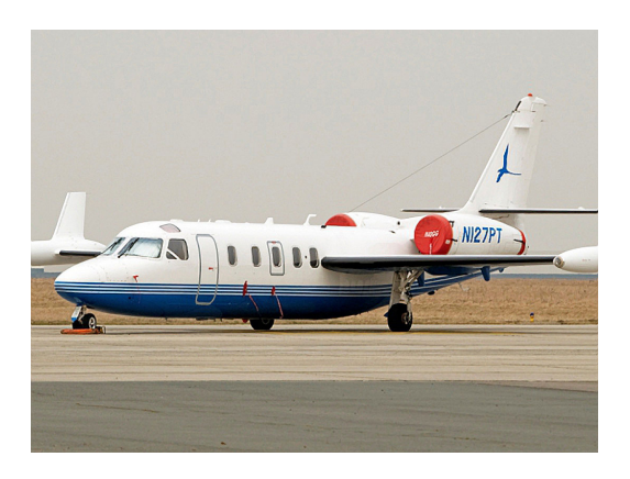
Engine Covers & Cockpit HeatShields