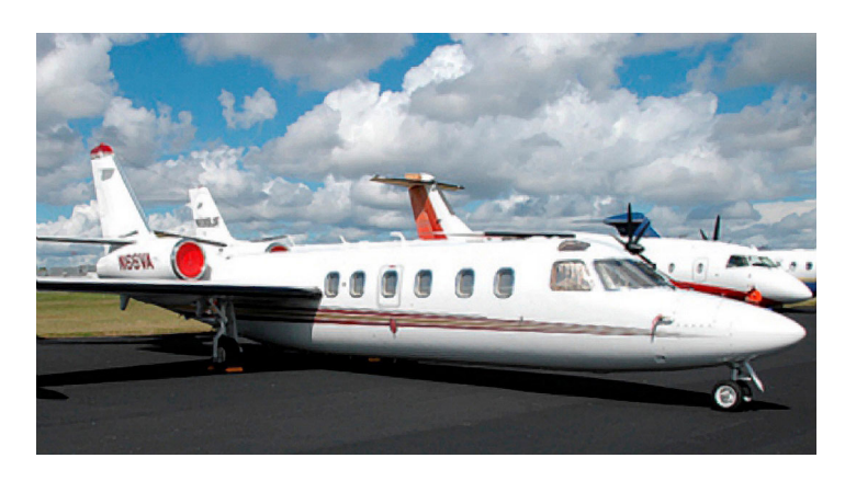
Westwind Engine Intake Plugs