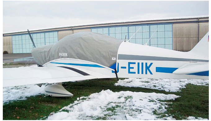
Robin R.2160 Canopy/Engine Cover