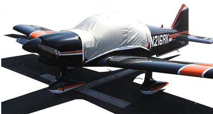
Robin R.2160 Canopy Cover

Travel Covers are made with Silver Solution-Dyed Polyester fabric and only lined over the windshield to save weight. The material is lightweight and more compact for easy stowage in the aircraft. The polyester material is water resistant, but only intended for occasional use outside. We also have an ultra lightweight material available for fitted hangar dust covers. For daily outdoor use, the non-travel Sunbrella Cover is the best choice.