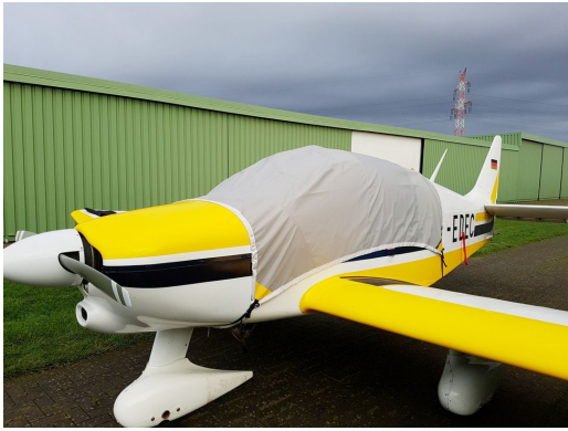
Robin DR400/R Travel Cover, Light Weight Travel Canopy Cover

the hottest of days. It is water, ice and snow repellent, yet breathable to allow moisture to escape from between the cover and the aircraft surface.