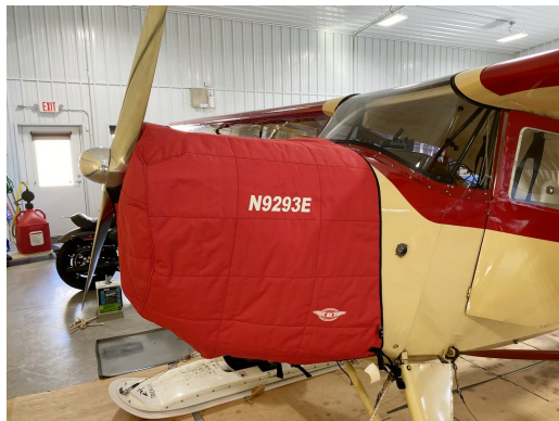
Aeronca 11AC Chief Insulated Engine Cover

This cover type is made from Silver Acrylic Sunbrella canvas and is 100% lined with a soft and smooth microfiber. Bruce's Custom Covers developed this material combination especially for aircraft protection. The outer material is medium weight and treated for water resistance, UV resistance and anti-static buildup. The inner lining is a very soft and smooth microfiber to prevent scratching. The material is very reflective, and tests show that the cabin interior temperature can be reduced to near-ambient temperature on the hottest of days. It is water, ice and snow repellent, yet breathable to allow moisture to escape from between the cover and the aircraft surface.