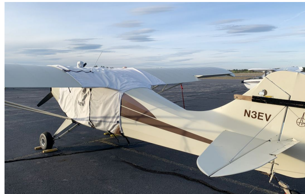
Aeronca Chief 11BC Extended Over-Top Canopy Cover