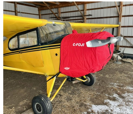
Aeronca 11AC Chief Insulated Engine Cover