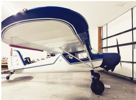
Cessna 140 Insulated Engine Cover

This cover type is made from Silver Acrylic Sunbrella canvas and is 100% lined with a soft and smooth microfiber. Bruce's Custom Covers developed this material combination especially for aircraft protection. The outer material is medium weight and treated for water resistance, UV resistance and anti-static buildup. The inner lining is a very soft and smooth microfiber to prevent scratching. The material is very reflective, and tests show that the cabin interior temperature can be reduced to near-ambient temperature on the hottest of days. It is water, ice and snow repellent, yet breathable to allow moisture to escape from between the cover and the aircraft surface.