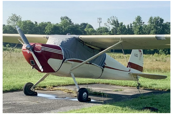
Cessna 140 Travel Weight Canopy Cover