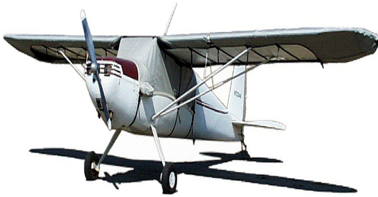
Cessna 120 Canopy Cover & Wing Covers