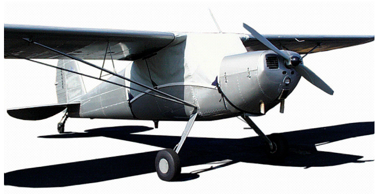
Cessna 120 Over-Top Canopy Cover