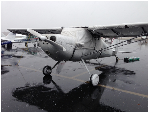
Cessna 120/140 Canopy and Wing Covers