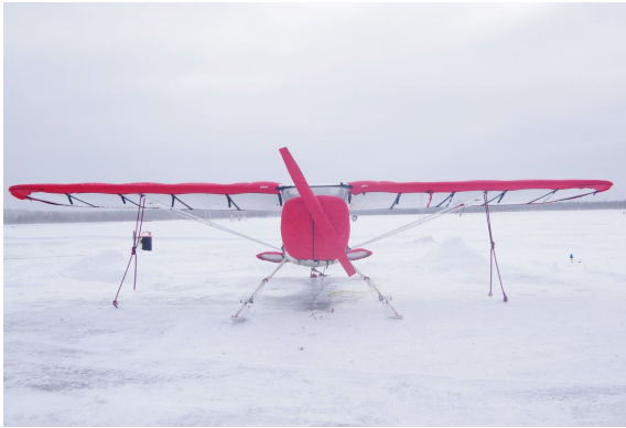
Cessna 120 Insulated Engine & Prop Covers, Wing & Tail Covers

This cover type is made from Silver Acrylic Sunbrella canvas and is 100% lined with a soft and smooth microfiber. Bruce's Custom Covers developed this material combination especially for aircraft protection. The outer material is medium weight and treated for water resistance, UV resistance and anti-static buildup. The inner lining is a very soft and smooth microfiber to prevent scratching. The material is very reflective, and tests show that the cabin interior temperature can be reduced to near-ambient temperature on the hottest of days. It is water, ice and snow repellent, yet breathable to allow moisture to escape from between the cover and the aircraft surface.