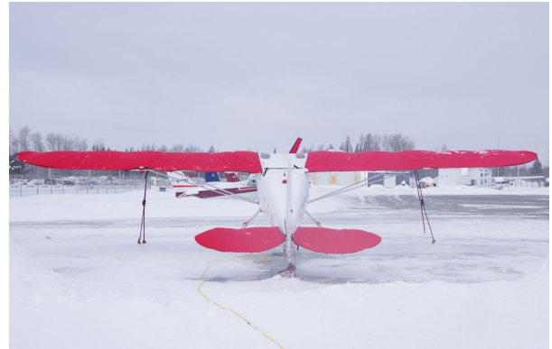
Cessna 140 Over The Top Style Canopy Cover, Wing Covers Cessna 120 Insulated Engine & Prop Covers, Wing & Tail Covers