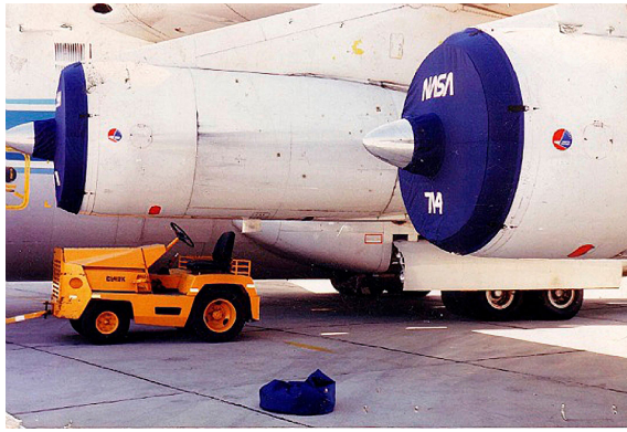
Intake Covers for Lockheed C-141