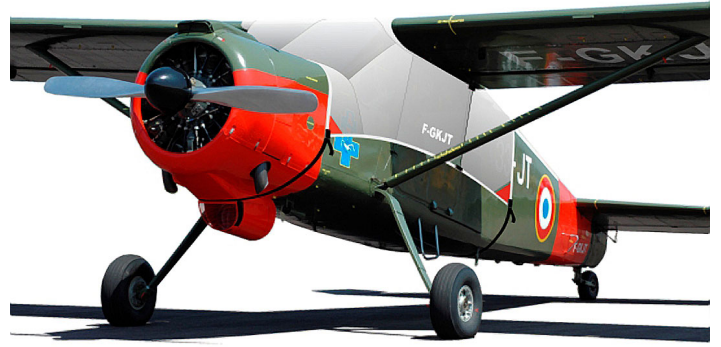
Broussard Canopy Cover (illustration)