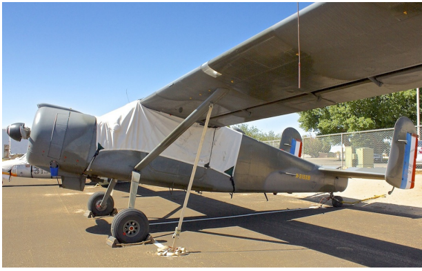
Broussard Canopy Cover