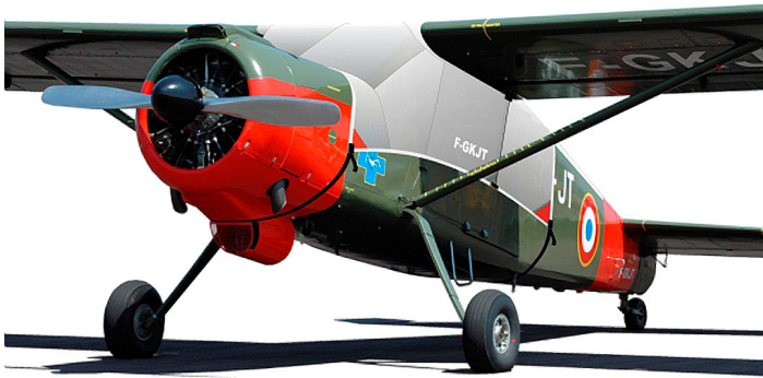
Broussard Canopy Cover (illustration)

This cover type is made from Silver Acrylic Sunbrella canvas and is 100% lined with a soft and smooth microfiber. Bruce's Custom Covers developed this material combination especially for aircraft protection. The outer material is medium weight and treated for water resistance, UV resistance and anti-static buildup. The inner lining is a very soft and smooth microfiber to prevent scratching. The material is very reflective, and tests show that the cabin interior temperature can be reduced to near-ambient temperature on the hottest of days. It is water, ice and snow repellent, yet breathable to allow moisture to escape from between the cover and the aircraft surface.