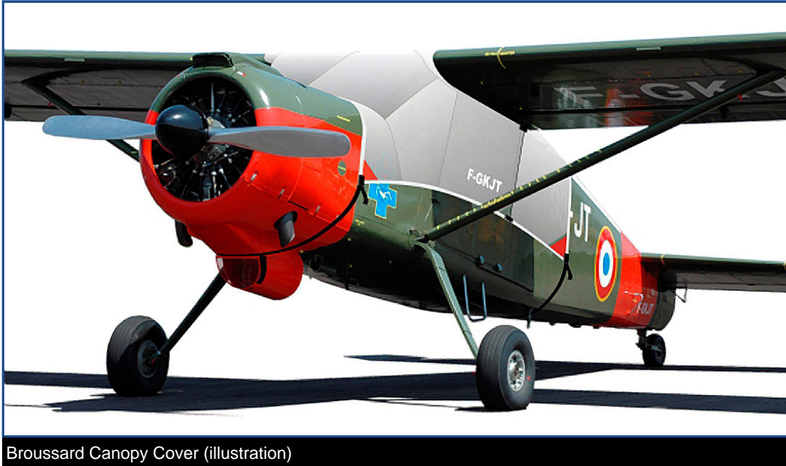
Broussard Canopy Cover (illustration)