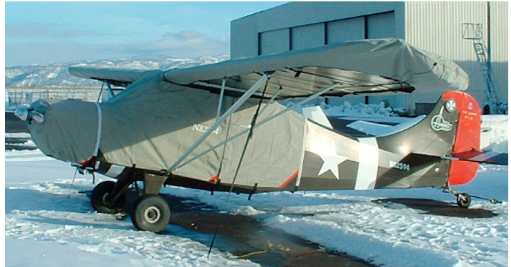
Extended Canopy Cover, Engine & Wing Covers