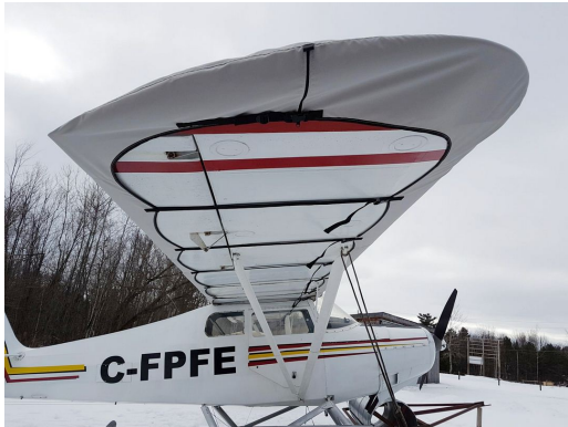
Christavia Mk 1 Wing Covers

WINTER USE MATERIAL - Made with Solution-Dyed Polyester fabric, this option is intended for seasonal use to aid in deicing, rain mitigation, or for occasional travel. The material is lighter and more compact, but more susceptible to UV damage and may have a shorter useful life if used continuously outside than the all-year use material.