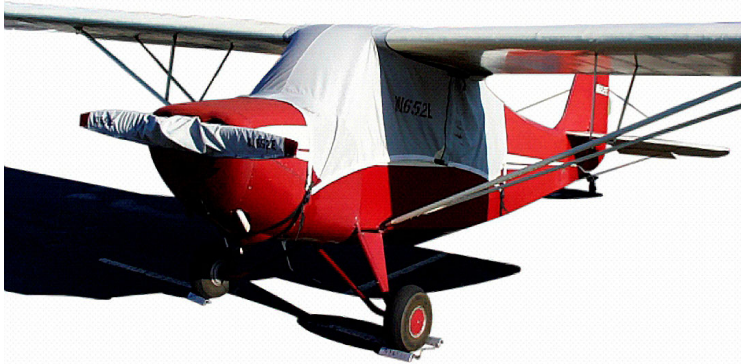
Aeronca Champ Canopy & Prop Covers

This cover type is made from Silver Acrylic Sunbrella canvas and is 100% lined with a soft and smooth microfiber. Bruce's Custom Covers developed this material combination especially for aircraft protection. The outer material is medium weight and treated for water resistance, UV resistance and anti-static buildup. The inner lining is a very soft and smooth microfiber to prevent scratching. The material is very reflective, and tests show that the cabin interior temperature can be reduced to near-ambient temperature on the hottest of days. It is water, ice and snow repellent, yet breathable to allow moisture to escape from between the cover and the aircraft surface.