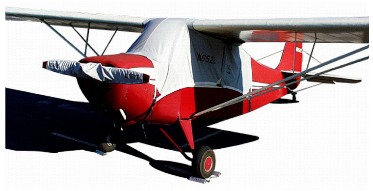
Aeronca Champ Canopy & Prop Covers