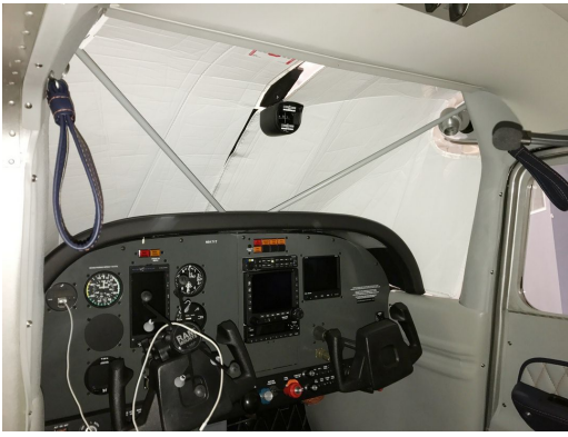
Cessna 180 Skywagon Windshield Heatshield, (W/ Compass)