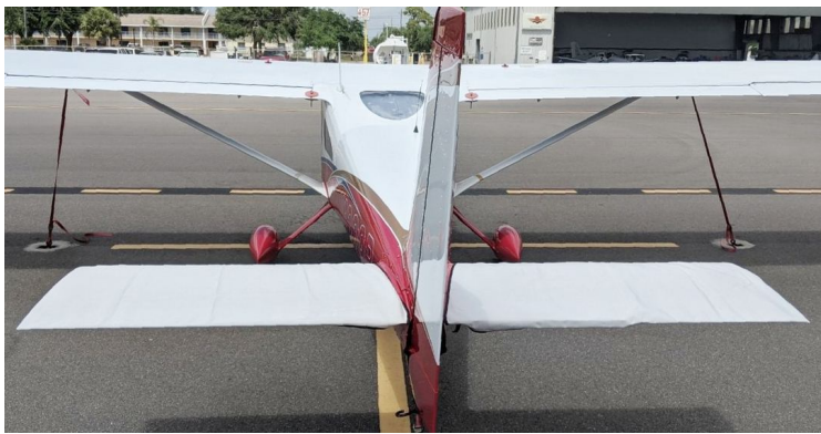
Cessna 162 Skycatcher Horizontal Stabilizer Covers