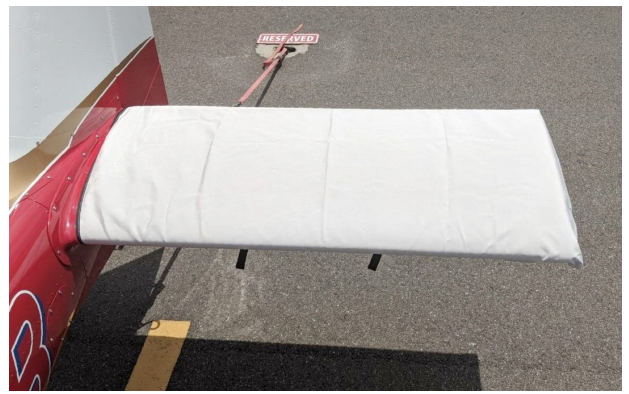
Cessna 162 Skycatcher Horizontal Stabilizer Covers