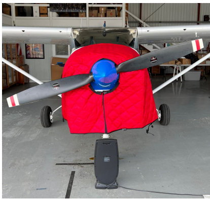
Insulated Hangar Blanket on Cessna 182