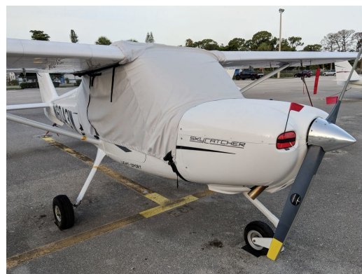
Cessna Skycatcher 162 Canopy Cover and Engine Inlet Plugs