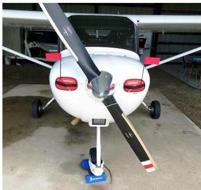
Cessna Skycatcher 162 Engine Inlet Plugs

Engine Inlet Plugs are custom fit for your Cessna Skycatcher 162 intakes, made with heavy-duty vinyl material, and stuffed with a single block of sculpted urethane foam. Each plug has a zipper that allows the foam to be removed and dried if necessary. Engine plugs have warning flags that are visible from the cockpit or 'remove before flight' streamers sewn onto the face of the plugs. Most plugs are imprinted with the aircraft registration number in black for an extra charge. Storage bag NOT included. Engine plugs may be inserted after flight when the engine is still warm. Engine Inlet Plugs are commonly referred to as Cowl Plugs, Intake Plugs, Cowl Blocks, Engine Blocks, and Engine Bung.