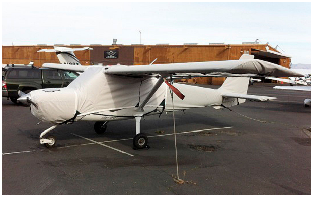
Cessna Skycatcher Full Cover Set