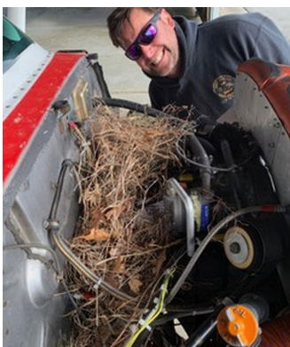
Cessna 172 Bird Nest Problem

Engine Inlet Plugs are custom fit for your Cessna Skycatcher 162 intakes, made with heavy-duty vinyl material, and stuffed with a single block of sculpted urethane foam. Each plug has a zipper that allows the foam to be removed and dried if necessary. Engine plugs have warning flags that are visible from the cockpit or 'remove before flight' streamers sewn onto the face of the plugs. Most plugs are imprinted with the aircraft registration number in black for an extra charge. Storage bag NOT included. Engine plugs may be inserted after flight when the engine is still warm. Engine Inlet Plugs are commonly referred to as Cowl Plugs, Intake Plugs, Cowl Blocks, Engine Blocks, and Engine Bung.