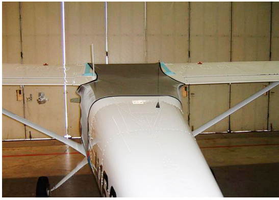
Cessna Skycatcher Canopy Cover