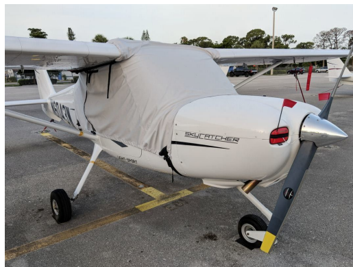
Cessna Skycatcher 162 Canopy Cover and Engine Inlet Plugs