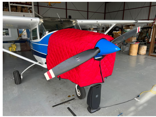
Insulated Hangar Blanket on Cessna 182