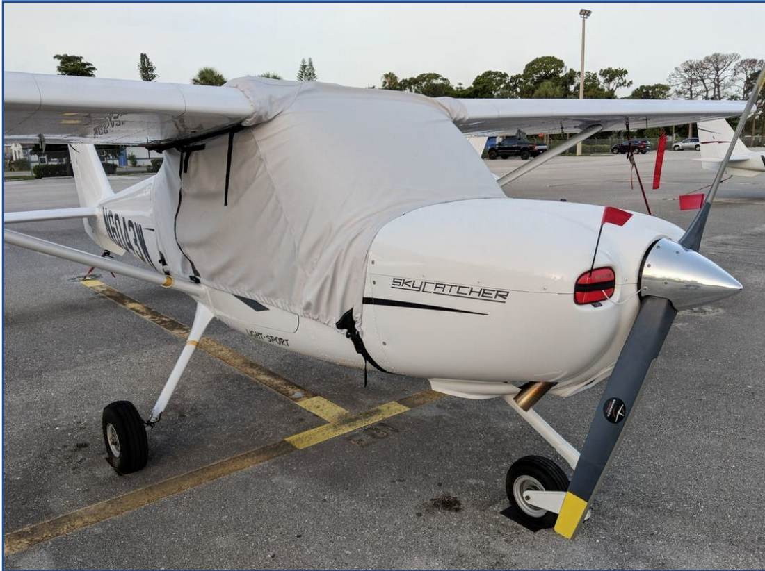
Cessna Skycatcher 162 Canopy Cover and Engine Inlet Plugs