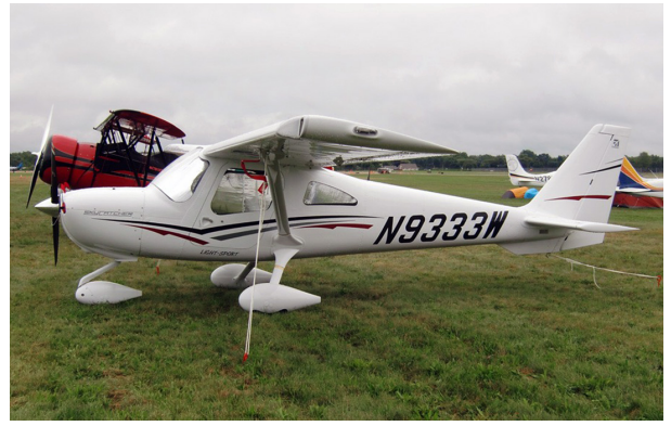
Cessna Skycatcher 162 Heatshield Set