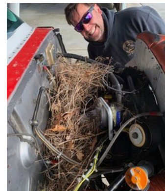
Cessna 172 Bird Nest Problem