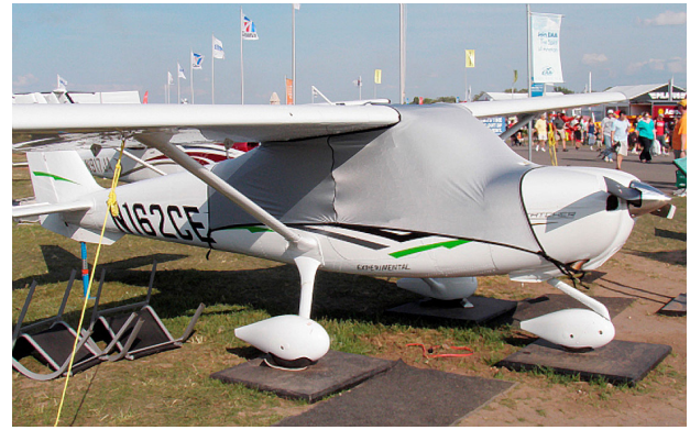
Cessna Skycatcher Spandex FlyAway Travel Cover