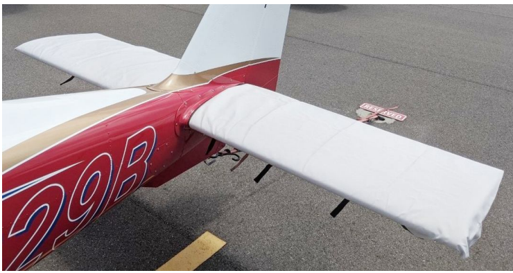
Cessna 162 Skycatcher Horizontal Stabilizer Covers