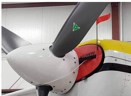
Cessna 180/185 Skywagon Engine Inlet Plugs