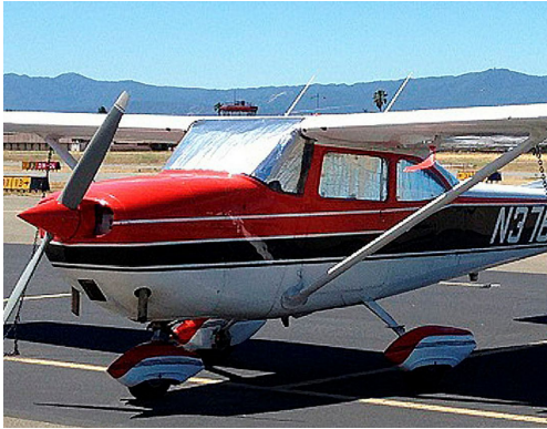
Cessna 172 Cabin HeatShields

Windshield Heatshields are interior sunshades for an aircraft's front windshield. The product is a unique composite of closed-cell foam with a silver mylar finish. The semi-rigid design is stiff enough to stand along the inside of the windshield using sun visors or window framing. It folds up flat and easily stores in the included storage sleeve. Some designs may require velcro and suction cups or split right and left sides. A Heatshield is an excellent short-term remedy for cockpit overheating. An external fabric cover is far more effective and practical for long-term protection.