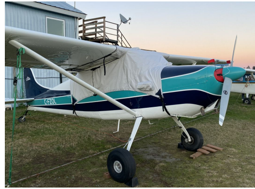
Cessna 170B Over The Top Style Canopy Cover & Engine Plugs