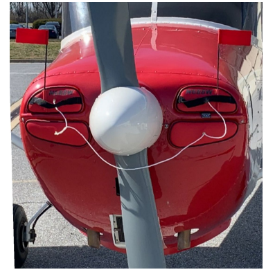
Cessna 170 Engine Plugs