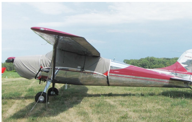
Cessna 170B Canopy & Engine Covers

This cover type is made from Silver Acrylic Sunbrella canvas and is 100% lined with a soft and smooth microfiber. Bruce's Custom Covers developed this material combination especially for aircraft protection. The outer material is medium weight and treated for water resistance, UV resistance and anti-static buildup. The inner lining is a very soft and smooth microfiber to prevent scratching. The material is very reflective, and tests show that the cabin interior temperature can be reduced to near-ambient temperature on the hottest of days. It is water, ice and snow repellent, yet breathable to allow moisture to escape from between the cover and the aircraft surface.