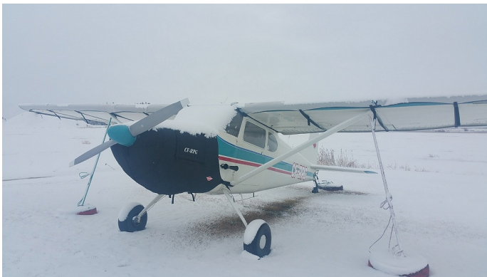
Cessna 170 Insulated Engine Cover, Wing Covers

WINTER USE MATERIAL - Made with Solution-Dyed Polyester fabric, this option is intended for seasonal use to aid in deicing, rain mitigation, or for occasional travel. The material is lighter and more compact, but more susceptible to UV damage and may have a shorter useful life if used continuously outside than the all-year use material.