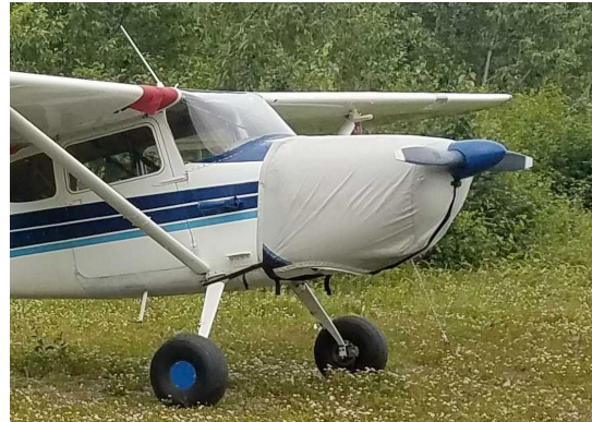
Cessna 170 Engine Cover