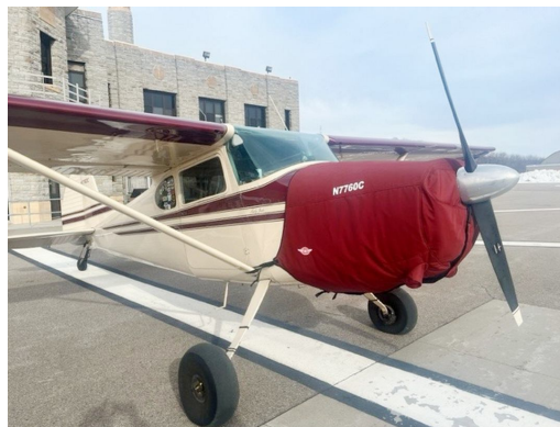
Cessna 170B Insulated Engine Cover