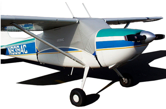
Cessna 180 Canopy Cover