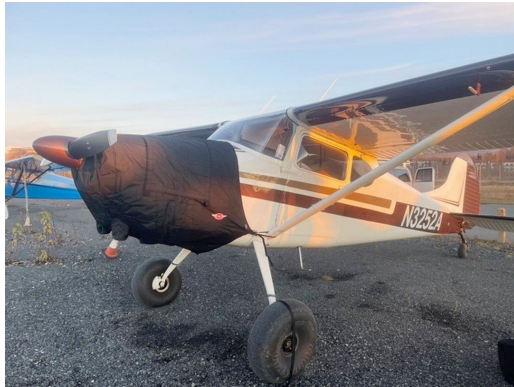
170B Insulated Engine Cover

This cover type is made from Silver Acrylic Sunbrella canvas and is 100% lined with a soft and smooth microfiber. Bruce's Custom Covers developed this material combination especially for aircraft protection. The outer material is medium weight and treated for water resistance, UV resistance and anti-static buildup. The inner lining is a very soft and smooth microfiber to prevent scratching. The material is very reflective, and tests show that the cabin interior temperature can be reduced to near-ambient temperature on the hottest of days. It is water, ice and snow repellent, yet breathable to allow moisture to escape from between the cover and the aircraft surface.