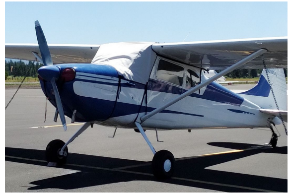
Cessna 170 Windshield Cover