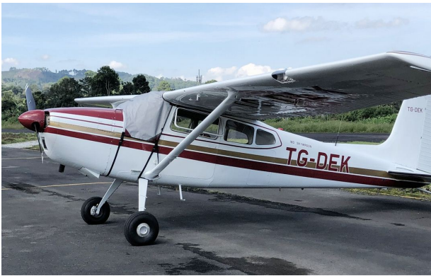
Cessna 180 Windshield Cover

This cover type is made from Silver Acrylic Sunbrella canvas and is 100% lined with a soft and smooth microfiber. Bruce's Custom Covers developed this material combination especially for aircraft protection. The outer material is medium weight and treated for water resistance, UV resistance and anti-static buildup. The inner lining is a very soft and smooth microfiber to prevent scratching. The material is very reflective, and tests show that the cabin interior temperature can be reduced to near-ambient temperature on the hottest of days. It is water, ice and snow repellent, yet breathable to allow moisture to escape from between the cover and the aircraft surface.