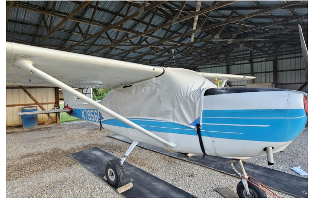
Cessna 172F Canopy Cover, Wrap-Around