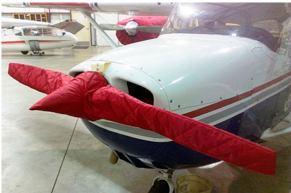
Cessna 172 2-blade Insulated Propellor/Spinner Cover

This cover type is made from Silver Acrylic Sunbrella canvas and is 100% lined with a soft and smooth microfiber. Bruce's Custom Covers developed this material combination especially for aircraft protection. The outer material is medium weight and treated for water resistance, UV resistance and anti-static buildup. The inner lining is a very soft and smooth microfiber to prevent scratching. The material is very reflective, and tests show that the cabin interior temperature can be reduced to near-ambient temperature on the hottest of days. It is water, ice and snow repellent, yet breathable to allow moisture to escape from between the cover and the aircraft surface.