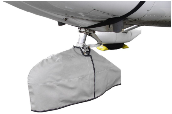
Cessna 172 Nose Gear Fairing Cover