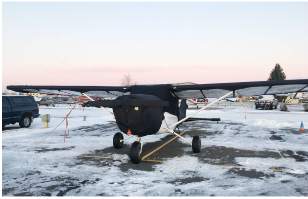
Cessna 172 Canopy, Engine, Prop, Wing & Empennage Covers