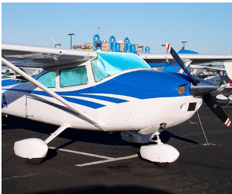
Cessna 182 HeatShield Set

Windshield Heatshields are interior sunshades for an aircraft's front windshield. The product is a unique composite of closed-cell foam with a silver mylar finish. The semi-rigid design is stiff enough to stand along the inside of the windshield using sun visors or window framing. It folds up flat and easily stores in the included storage sleeve. Some designs may require velcro and suction cups or split right and left sides. A Heatshield is an excellent short-term remedy for cockpit overheating. An external fabric cover is far more effective and practical for long-term protection.