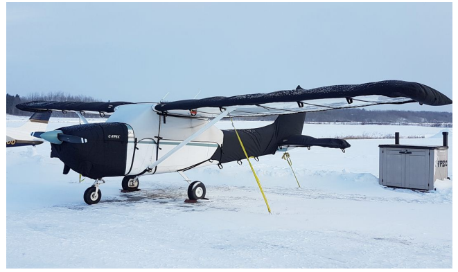
Cessna 172 Engine, Wings and Empennage Covers