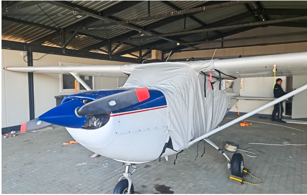
Cessna 172 Extended Canopy Cover, Over-Top Type, Down To Fuselage Base, Covers Gas Caps)

This cover type is made from Silver Acrylic Sunbrella canvas and is 100% lined with a soft and smooth microfiber. Bruce's Custom Covers developed this material combination especially for aircraft protection. The outer material is medium weight and treated for water resistance, UV resistance and anti-static buildup. The inner lining is a very soft and smooth microfiber to prevent scratching. The material is very reflective, and tests show that the cabin interior temperature can be reduced to near-ambient temperature on the hottest of days. It is water, ice and snow repellent, yet breathable to allow moisture to escape from between the cover and the aircraft surface.