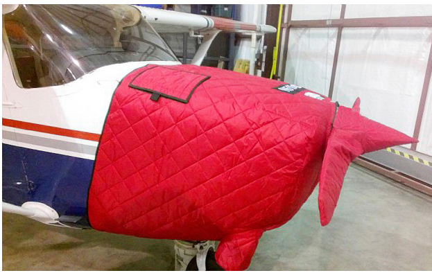
Cessna 172 Insulated Engine Cover w/ Oil Filler Door flap and Insulated Prop/Spinner Cover