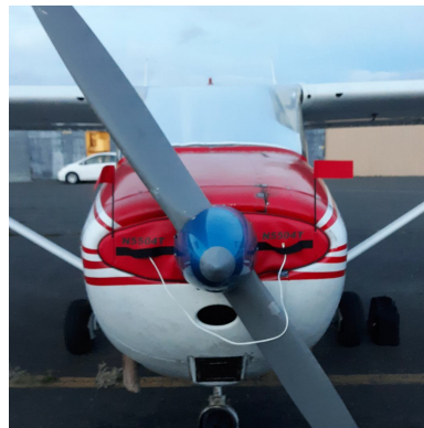
Cessna 172E Engine Inlet Plugs