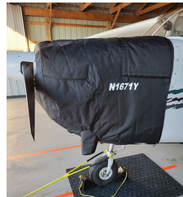
Cessna 172 Insulated Engine Cover, Fully Enclosed