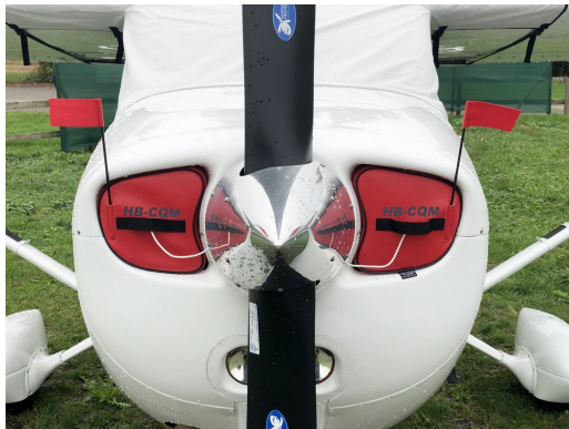
Cessna 172 Engine Plugs

Engine Inlet Plugs are custom fit for your Cessna 172 & 175 (T-41) intakes, made with heavy-duty vinyl material, and stuffed with a single block of sculpted urethane foam. Each plug has a zipper that allows the foam to be removed and dried if necessary. Engine plugs have warning flags that are visible from the cockpit or 'remove before flight' streamers sewn onto the face of the plugs. Most plugs are imprinted with the aircraft registration number in black for an extra charge. Storage bag NOT included. Engine plugs may be inserted after flight when the engine is still warm. Engine Inlet Plugs are commonly referred to as Cowl Plugs, Intake Plugs, Cowl Blocks, Engine Blocks, and Engine Bungs.