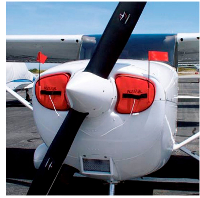
Cessna 172 Engine Plugs