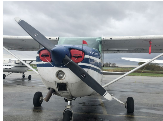
Cessna 172M Engine Inlet Plugs