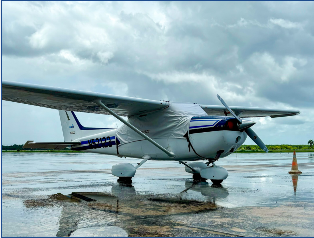
Cessna 172 Canopy Cover, Wrap-Around Type