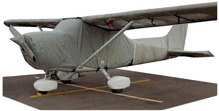
Cessna 172 Propellor Cover, 2 Blade