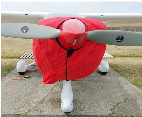
Cessna Cardinal 177 Insulated Engine Cover

This cover type is made from Silver Acrylic Sunbrella canvas and is 100% lined with a soft and smooth microfiber. Bruce's Custom Covers developed this material combination especially for aircraft protection. The outer material is medium weight and treated for water resistance, UV resistance and anti-static buildup. The inner lining is a very soft and smooth microfiber to prevent scratching. The material is very reflective, and tests show that the cabin interior temperature can be reduced to near-ambient temperature on the hottest of days. It is water, ice and snow repellent, yet breathable to allow moisture to escape from between the cover and the aircraft surface.