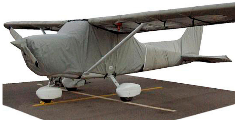
Cessna 172 Propellor Cover, 2 Blade