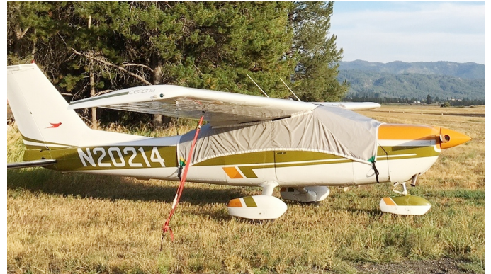
Cessna 177 Cardinal Travel Cover, Light Weight Travel Canopy Cover (Over-The-Top Style), 7 Lbs