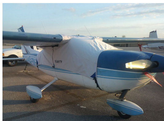
Cessna 177 Cardinal Canopy Cover, Over-Top Style