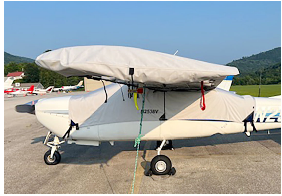
Cessna 177 Cardinal Over-Top Canopy Cover, extends to cover gas caps, & Wing Covers