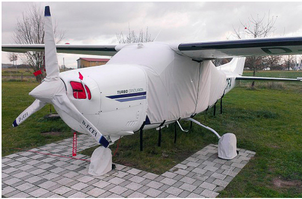
Cessna 210 Extended Canopy Cover, Engine Plugs, Prop and Tire Covers

Engine Inlet Plugs are custom fit for your Cessna 177 Cardinal intakes, made with heavy-duty vinyl material, and stuffed with a single block of sculpted urethane foam. Each plug has a zipper that allows the foam to be removed and dried if necessary. Engine plugs have warning flags that are visible from the cockpit or 'remove before flight' streamers sewn onto the face of the plugs. Most plugs are imprinted with the aircraft registration number in black for an extra charge. Storage bag NOT included. Engine plugs may be inserted after flight when the engine is still warm. Engine Inlet Plugs are commonly referred to as Cowl Plugs, Intake Plugs, Cowl Blocks, Engine Blocks, and Engine Bungs.