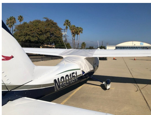
Cessna Cardinal Over-Top Canopy Cover

This cover type is made from Silver Acrylic Sunbrella canvas and is 100% lined with a soft and smooth microfiber. Bruce's Custom Covers developed this material combination especially for aircraft protection. The outer material is medium weight and treated for water resistance, UV resistance and anti-static buildup. The inner lining is a very soft and smooth microfiber to prevent scratching. The material is very reflective, and tests show that the cabin interior temperature can be reduced to near-ambient temperature on the hottest of days. It is water, ice and snow repellent, yet breathable to allow moisture to escape from between the cover and the aircraft surface.