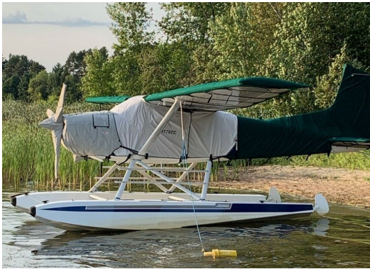
Cessna A185F Complete Cover Set

WINTER USE MATERIAL - Made with Solution-Dyed Polyester fabric, this option is intended for seasonal use to aid in deicing, rain mitigation, or for occasional travel. The material is lighter and more compact, but more susceptible to UV damage and may have a shorter useful life if used continuously outside than the all-year use material.