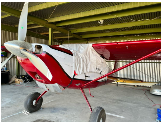
Cessna 182A Canopy Cover, Over Top Type, w/Bubble Windows

This cover type is made from Silver Acrylic Sunbrella canvas and is 100% lined with a soft and smooth microfiber. Bruce's Custom Covers developed this material combination especially for aircraft protection. The outer material is medium weight and treated for water resistance, UV resistance and anti-static buildup. The inner lining is a very soft and smooth microfiber to prevent scratching. The material is very reflective, and tests show that the cabin interior temperature can be reduced to near-ambient temperature on the hottest of days. It is water, ice and snow repellent, yet breathable to allow moisture to escape from between the cover and the aircraft surface.