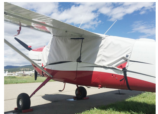
Cessna A185F Canopy Cover