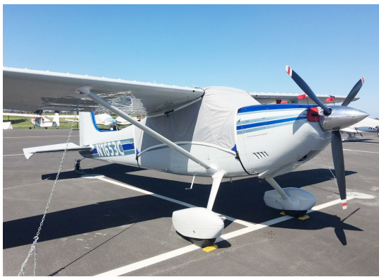
Cessna 180 Travel Weight Canopy Cover, Engine Plugs