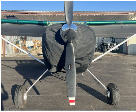
Cessna 180B Insulated Engine Cover, Fully Enclosed