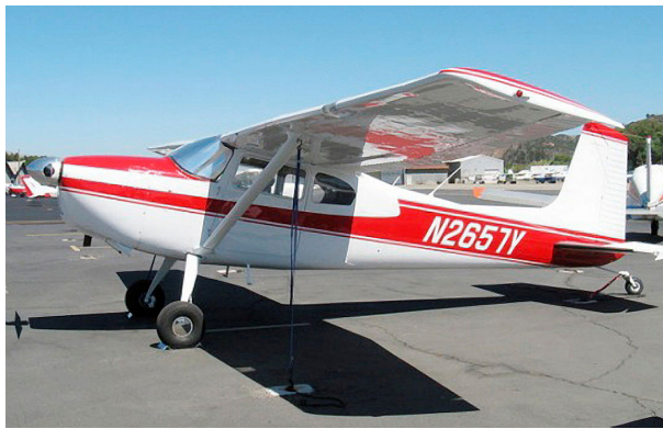
Cessna 180 & 185 Windshield HeatShield

Windshield Heatshields are interior sunshades for an aircraft's front windshield. The product is a unique composite of closed-cell foam with a silver mylar finish. The semi-rigid design is stiff enough to stand along the inside of the windshield using sun visors or window framing. It folds up flat and easily stores in the included storage sleeve. Some designs may require velcro and suction cups or split right and left sides. A Heatshield is an excellent short-term remedy for cockpit overheating. An external fabric cover is far more effective and practical for long-term protection.