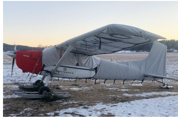
Cessna A185E Winter Cover Set