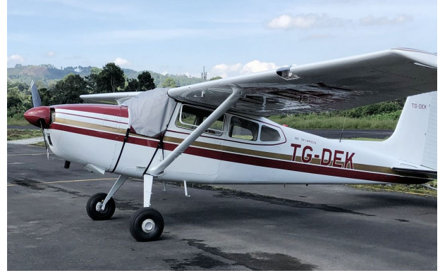
Cessna 180 Windshield Cover