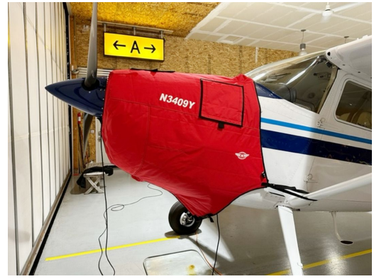
Cessna 180H Insulated Engine Cover