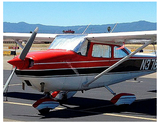
Cessna 172 Cabin HeatShields