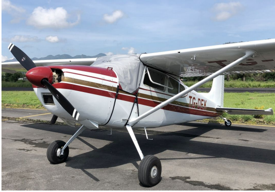
Cessna 180 Windshield Cover

The material is very reflective, and tests show that the cabin interior temperature can be reduced to near-ambient temperature on the hottest of days. It is water, ice and snow repellent, yet breathable to allow moisture to escape from between the cover and the aircraft surface.