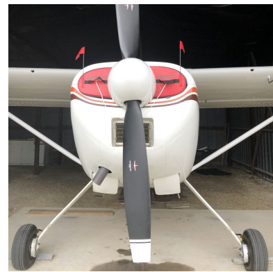
Cessna 180, 185 Engine Plugs