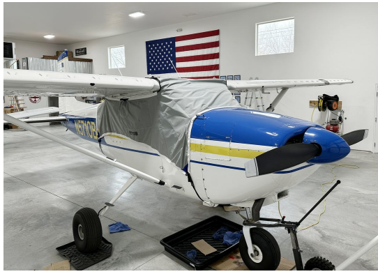
Cessna 182 Light Weight Wrap Around Canopy Cover