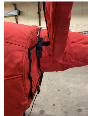
Cessna 182A Insulated Engine & Prop Covers