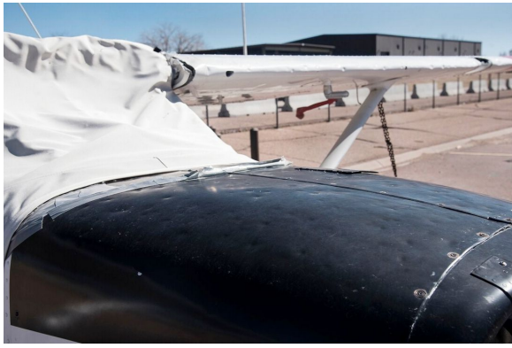
Cessna 182 Hail Damage, & Canopy Cover