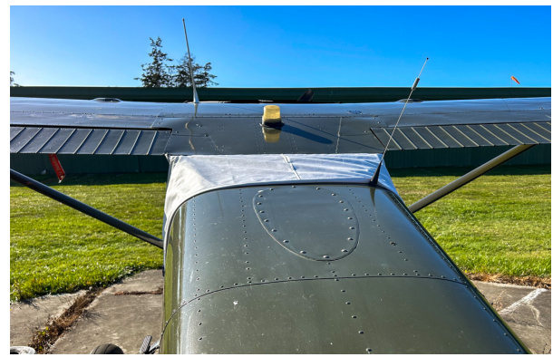
Cessna 182 Skylane Canopy Cover, Wrap-Around, (1956-61, Thru Model 182d)