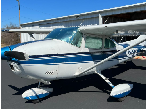
Cessna 182 Cockpit HeatShield Set

Windshield Heatshields are interior sunshades for an aircraft's front windshield. The product is a unique composite of closed-cell foam with a silver mylar finish. The semi-rigid design is stiff enough to stand along the inside of the windshield using sun visors or window framing. It folds up flat and easily stores in the included storage sleeve. Some designs may require velcro and suction cups or split right and left sides. A Heatshield is an excellent short-term remedy for cockpit overheating. An external fabric cover is far more effective and practical for long-term protection.