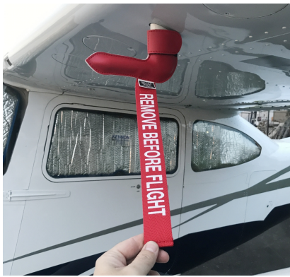
Cessna 182 Skylane Pitot Cover

Engine Inlet Plugs are custom fit for your Cessna 182 Skylane intakes, made with heavy-duty vinyl material, and stuffed with a single block of sculpted urethane foam. Each plug has a zipper that allows the foam to be removed and dried if necessary. Engine plugs have warning flags that are visible from the cockpit or 'remove before flight' streamers sewn onto the face of the plugs. Most plugs are imprinted with the aircraft registration number in black for an extra charge. Storage bag NOT included. Engine plugs may be inserted after flight when the engine is still warm. Engine Inlet Plugs are commonly referred to as Cowl Plugs, Intake Plugs, Cowl Blocks, Engine Blocks, and Engine Bungs.