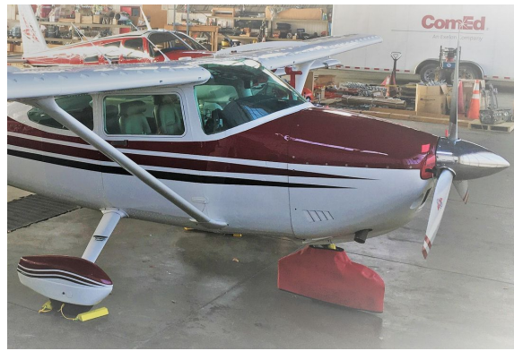
Cessna 182 Skylane Nose Wheelpant Cover