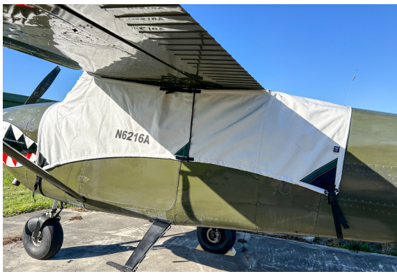
Cessna 182 Skylane Canopy Cover, Wrap-Around, (1956-61, Thru Model 182d)