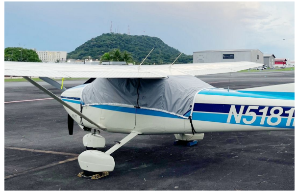
Cessna 182 Travel Canopy Cover