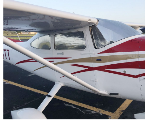
Cessna 182 Cabin HeatShields