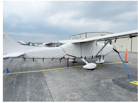
Cessna 182 Hail Protection Cover Set