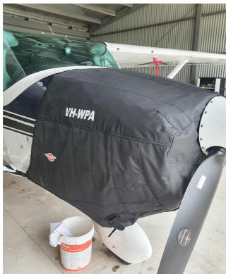
Cessna 182 Insulated Engine Cover, fully enclosed

This cover type is made from Silver Acrylic Sunbrella canvas and is 100% lined with a soft and smooth microfiber. Bruce's Custom Covers developed this material combination especially for aircraft protection. The outer material is medium weight and treated for water resistance, UV resistance and anti-static buildup. The inner lining is a very soft and smooth microfiber to prevent scratching. The material is very reflective, and tests show that the cabin interior temperature can be reduced to near-ambient temperature on the hottest of days. It is water, ice and snow repellent, yet breathable to allow moisture to escape from between the cover and the aircraft surface.