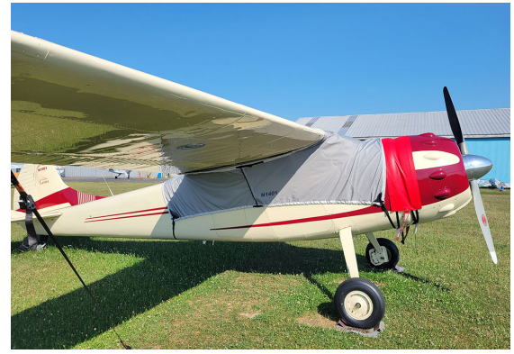
Cessna 190 Travel Cover, Light Weight Canopy Cover, Over-Top Type