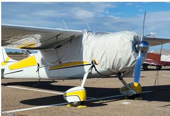
Cessna 190 & 195 Canopy Cover, Over-Top, 12" Fwd Ext, Gas Cap Ext., & Engine Cover