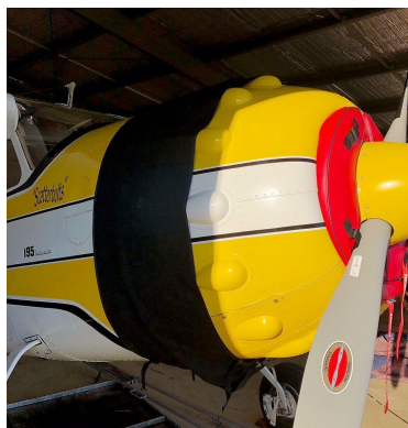
Cessna 195 Engine Plugs, Cowl Ring Gap Cover

Engine Inlet Plugs are custom fit for your Cessna 190 & 195 intakes, made with heavy-duty vinyl material, and stuffed with a single block of sculpted urethane foam. Each plug has a zipper that allows the foam to be removed and dried if necessary. Engine plugs have warning flags that are visible from the cockpit or 'remove before flight' streamers sewn onto the face of the plugs. Most plugs are imprinted with the aircraft registration number in black for an extra charge. Storage bag NOT included. Engine plugs may be inserted after flight when the engine is still warm. Engine Inlet Plugs are commonly referred to as Cowl Plugs, Intake Plugs, Cowl Blocks, Engine Blocks, and Engine Bungs.