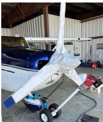
Cessna 182 Skylane 3-Blade Prop Cover

This cover type is made from Silver Acrylic Sunbrella canvas and is 100% lined with a soft and smooth microfiber. Bruce's Custom Covers developed this material combination especially for aircraft protection. The outer material is medium weight and treated for water resistance, UV resistance and anti-static buildup. The inner lining is a very soft and smooth microfiber to prevent scratching. The material is very reflective, and tests show that the cabin interior temperature can be reduced to near-ambient temperature on the hottest of days. It is water, ice and snow repellent, yet breathable to allow moisture to escape from between the cover and the aircraft surface.