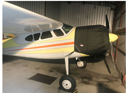
Cessna 195B Insulated Engine Cover