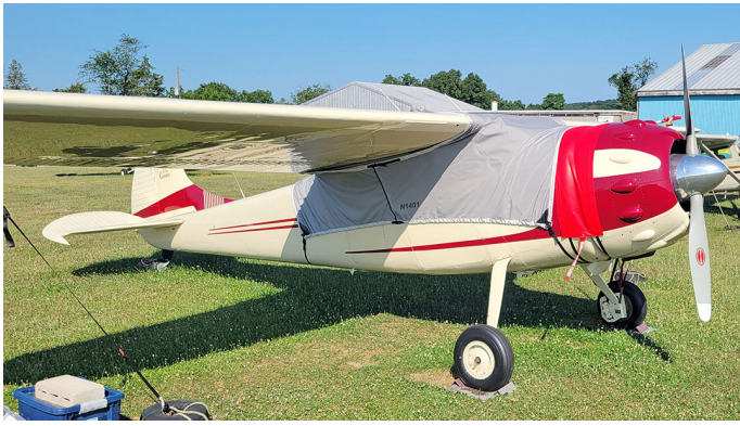
Cessna 190 Travel Cover, Light Weight Canopy Cover, Over-Top Type