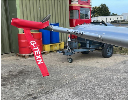
T6 Harvard Pitot Cover, shark fin type

Engine Inlet Plugs are custom fit for your Cessna 190 & 195 intakes, made with heavy-duty vinyl material, and stuffed with a single block of sculpted urethane foam. Each plug has a zipper that allows the foam to be removed and dried if necessary. Engine plugs have warning flags that are visible from the cockpit or 'remove before flight' streamers sewn onto the face of the plugs. Most plugs are imprinted with the aircraft registration number in black for an extra charge. Storage bag NOT included. Engine plugs may be inserted after flight when the engine is still warm. Engine Inlet Plugs are commonly referred to as Cowl Plugs, Intake Plugs, Cowl Blocks, Engine Blocks, and Engine Bunges.