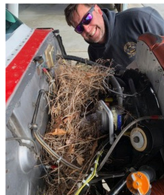
Cessna 172 Bird Nest Problem