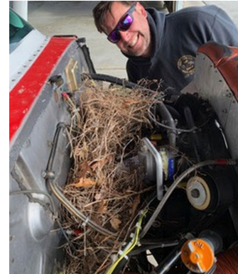
Cessna 172 Bird Nest Problem