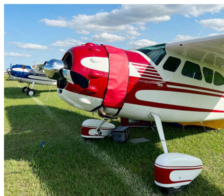
Cessna 195 Engine Cowl Ring Gap Cover