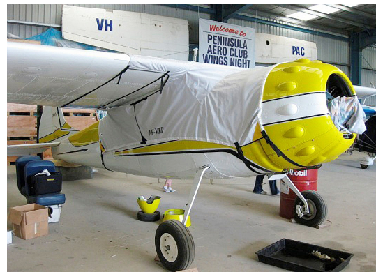
Cessna 195 Canopy Cover, over-top, 24" fwd ext to cover cowl ring gap, gas cap ext.