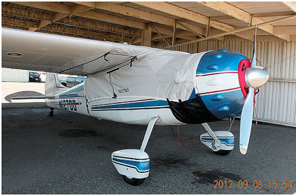
Cessna 195 Over-top Canopy Cover, 24" fwd ext to cover cowl ring gap, gas cap ext. & under belly cowl ring gap mesh covering