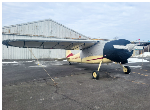
Cessna 190 Travel Canopy, Insulated Engine, Wing & Prop Covers