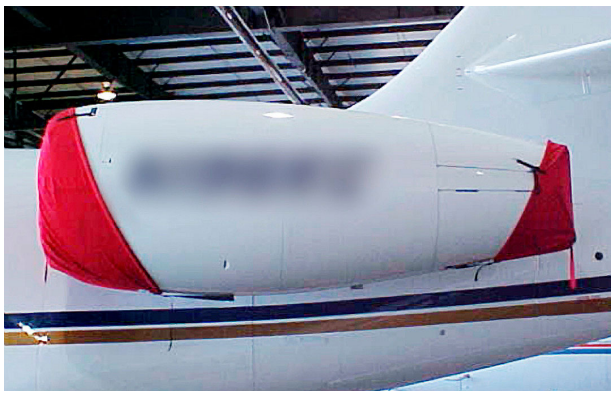
Falcon 2000 Intake/Exhaust Cover Set

The Falcon Jet 2000 Intake Covers are designed to install easily yet be completely storable. A spring steel hoop is sewn into the hem of each cover, allowing them to be installed without climbing onto the wing or using a stepladder. To store the covers the spring steel hoop folds like a band-saw blade into three nesting rings. Each cover folds into a compact circular bundle which is stored in the included duffle bag, yet they unfold quickly for use. The Tri-Fold Ring cover is made of medium weight nylon which is available in a variety of colors to match the paint trim. Each cover set comes complete with installation and folding instructions. The aircraft's registration number can be silkscreened onto the cover for an extra charge.