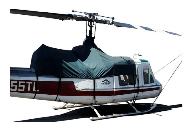
Bell 204/205 Engine/Mid-Cabin Cover