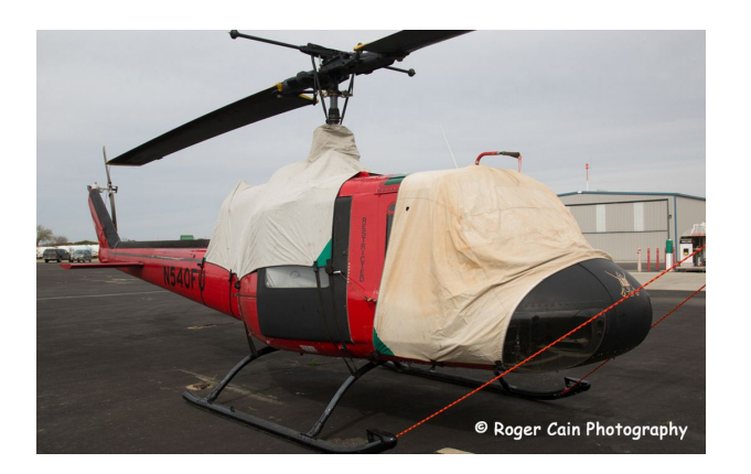
Bell 204 Engine and Cockpit Covers