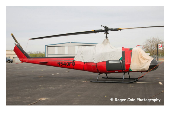
Bell 204 Engine and Cockpit Covers