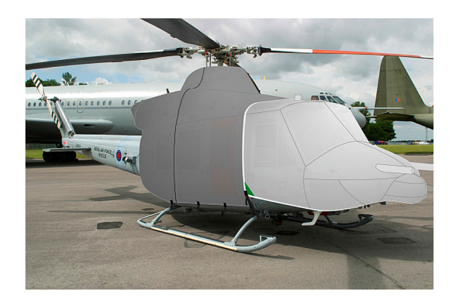
Forward Cabin Nose & Mid-Cabin/Engine Cover (extended to cross tubes)

This cover type is made from Silver Acrylic Sunbrella canvas and is 100% lined with a soft and smooth microfiber. Bruce's Custom Covers developed this material combination especially for aircraft protection. The outer material is medium weight and treated for water resistance, UV resistance and anti-static buildup. The inner lining is a very soft and smooth microfiber to prevent scratching. The material is very reflective, and tests show that the cabin interior temperature can be reduced to near-ambient temperature on the hottest of days. It is water, ice and snow repellent, yet breathable to allow moisture to escape from between the cover and the aircraft surface.