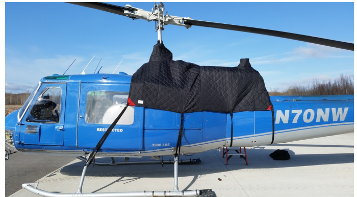
Bell 204 Insulated Engine Area Cover