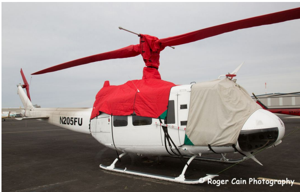
Bell 205 Engine, Rotor Mast, Blades & Forward Cabin Covers

WINTER USE MATERIAL - Made with Solution-Dyed Polyester fabric, this option is intended for seasonal use to aid in deicing, rain mitigation, or for occasional travel. The material is lighter and more compact, but more susceptible to UV damage and may have a shorter useful life if used continuously outside than the all-year use material.