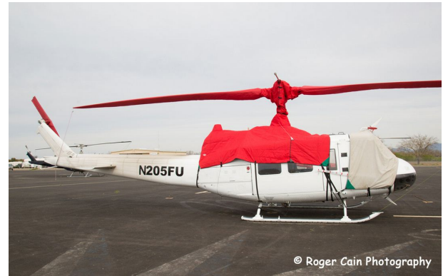
Bell 205 Engine, Rotor Mast, Blades & Forward Cabin Covers