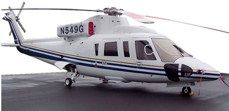
Snap-On Cockpit Cover

This cover type is made from Silver Acrylic Sunbrella canvas and is 100% lined with a soft and smooth microfiber. Bruce's Custom Covers developed this material combination especially for aircraft protection. The outer material is medium weight and treated for water resistance, UV resistance and anti-static buildup. The inner lining is a very soft and smooth microfiber to prevent scratching. The material is very reflective, and tests show that the cabin interior temperature can be reduced to near-ambient temperature on the hottest of days. It is water, ice and snow repellent, yet breathable to allow moisture to escape from between the cover and the aircraft surface.