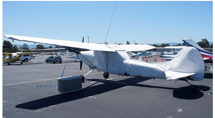
Wing Covers on Cessna Bird Dog