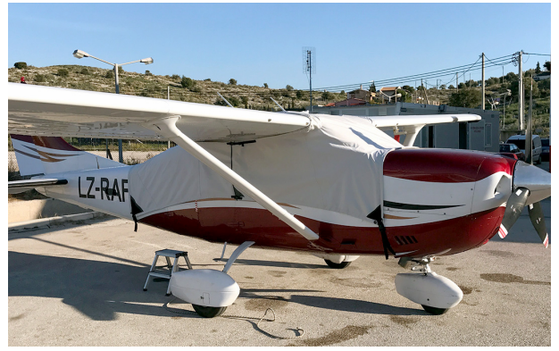
Cessna 206 Stationair Canopy Cover, Over-Top Style