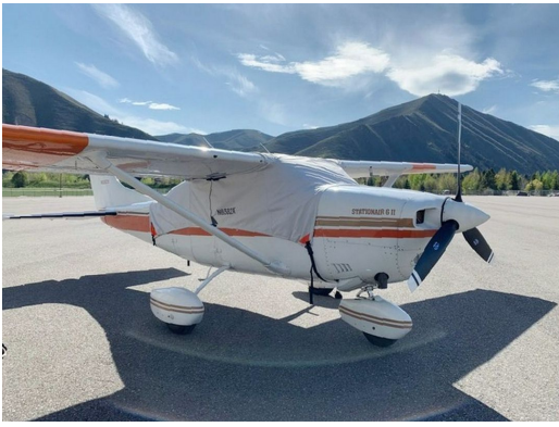
Cessna 206 Canopy Cover, Over-Top Style