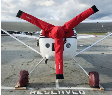
Cessna Skywagon Propellor/Spinner Cover, 3-blade type

This cover type is made from Silver Acrylic Sunbrella canvas and is 100% lined with a soft and smooth microfiber. Bruce's Custom Covers developed this material combination especially for aircraft protection. The outer material is medium weight and treated for water resistance, UV resistance and anti-static buildup. The inner lining is a very soft and smooth microfiber to prevent scratching. The material is very reflective, and tests show that the cabin interior temperature can be reduced to near-ambient temperature on the hottest of days. It is water, ice and snow repellent, yet breathable to allow moisture to escape from between the cover and the aircraft surface.