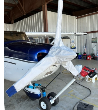
Cessna 182 Skylane 3-Blade Prop Cover