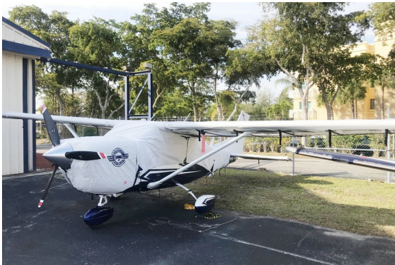
Cessna T206H Canopy, Engine, Wing & Empennage Covers

WINTER USE MATERIAL - Made with Solution-Dyed Polyester fabric, this option is intended for seasonal use to aid in deicing, rain mitigation, or for occasional travel. The material is lighter and more compact, but more susceptible to UV damage and may have a shorter useful life if used continuously outside than the all-year use material.