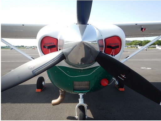
Cessna 206H Engine Plugs w/Oil Cooler Inlet Plug