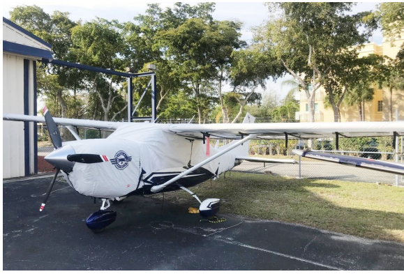
Cessna T206H Canopy, Engine, Wing & Empennage Covers