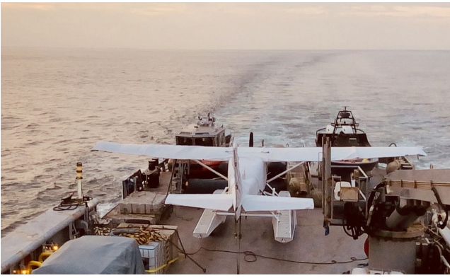
Cessna U206F Amphib Cover Set