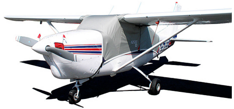
Cessna 210 Over-Top Canopy Cover