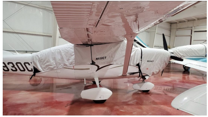
Textron Aviation Inc T206H Canopy cover over the top