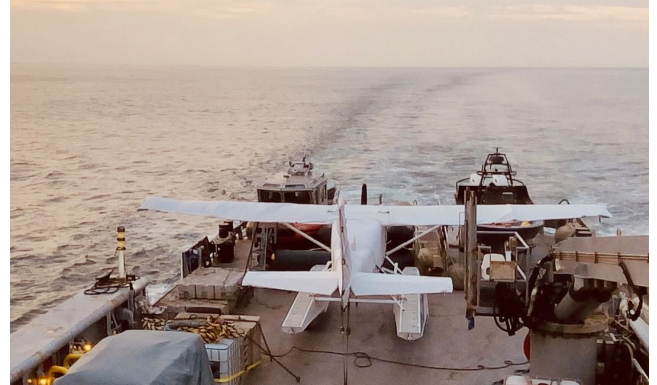
Cessna U206F Amphib Cover Set