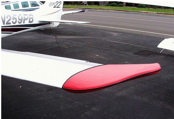
Cirrus SR-22 Wingtip Pad (also available for the Horiz. Stab.)

Designed to prevent damage to the aircraft extremities in crowded hangars, these products are made of bright red Naugahyde and thickly padded with a sandwich of closed cell foam.