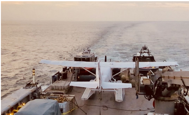
Cessna U206F Amphib Cover Set

WINTER USE MATERIAL - Made with Solution-Dyed Polyester fabric, this option is intended for seasonal use to aid in deicing, rain mitigation, or for occasional travel. The material is lighter and more compact, but more susceptible to UV damage and may have a shorter useful life if used continuously outside than the all-year use material.