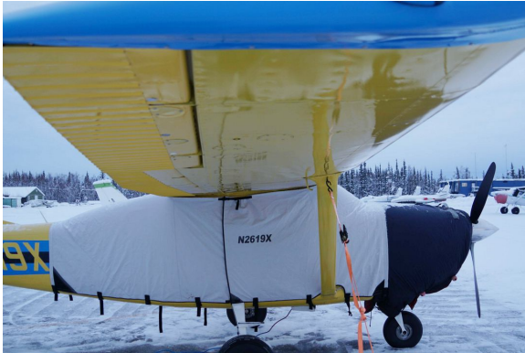
Cessna 206 Extended Canopy Cover, Insulated Engine Cover

This cover type is made from Silver Acrylic Sunbrella canvas and is 100% lined with a soft and smooth microfiber. Bruce's Custom Covers developed this material combination especially for aircraft protection. The outer material is medium weight and treated for water resistance, UV resistance and anti-static buildup. The inner lining is a very soft and smooth microfiber to prevent scratching. The material is very reflective, and tests show that the cabin interior temperature can be reduced to near-ambient temperature on the hottest of days. It is water, ice and snow repellent, yet breathable to allow moisture to escape from between the cover and the aircraft surface.