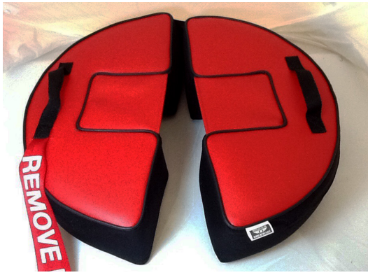
Bell 206 Swash Plate Plug