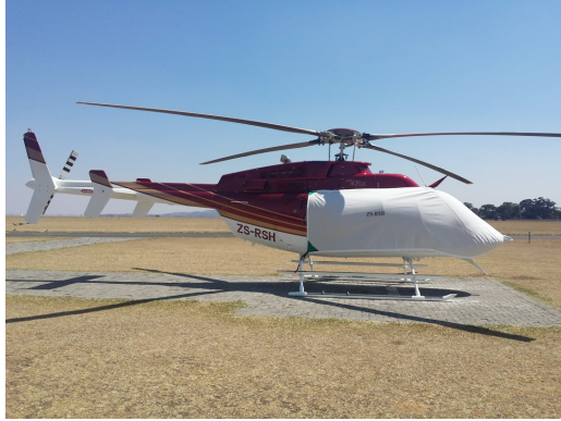
Bell 407 Bubble Cover with Wire Strike

This cover type is made from Silver Acrylic Sunbrella canvas and is 100% lined with a soft and smooth microfiber. Bruce's Custom Covers developed this material combination especially for aircraft protection. The outer material is medium weight and treated for water resistance, UV resistance and anti-static buildup. The inner lining is a very soft and smooth microfiber to prevent scratching. The material is very reflective, and tests show that the cabin interior temperature can be reduced to near-ambient temperature on the hottest of days. It is water, ice and snow repellent, yet breathable to allow moisture to escape from between the cover and the aircraft surface.