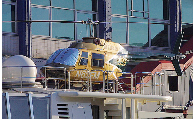
Bell 206B Jetranger Windshield Heatshields