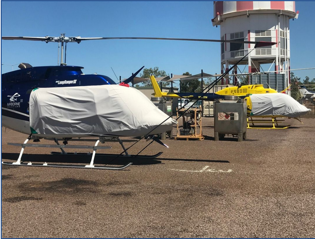
Bell JetRanger 206B and LongRanger206L Bubble Covers