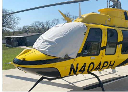
Bell 407 Windshield Cover