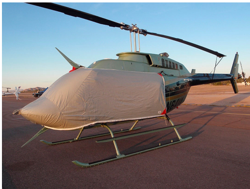
Bell 206L Longranger Bubble Cover

Travel Covers are made with Silver Solution-Dyed Polyester fabric and fully lined over the entire cover. The material is lightweight and more compact for easy stowage in the aircraft. The polyester material is water resistant, but only intended for occasional use outside. We also have an ultra lightweight material available for fitted hangar dust covers. For daily outdoor use, the non-travel Sunbrella Cover is the best choice.