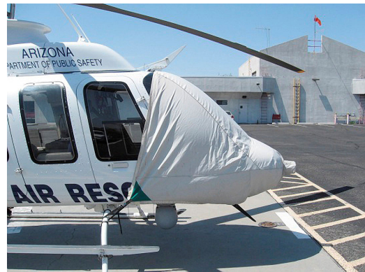
Bell 206L Windshield/Nose Cover