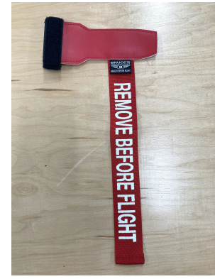
Pitot Tube Cover