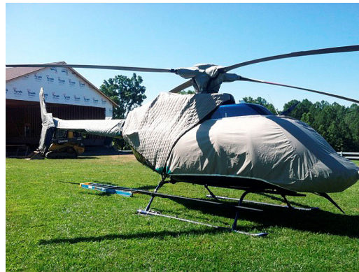
Bell 407 Covers: Bubble, Insulated Engine, Rotor Mast, Blades, Tailboom, Vertical Stabilizer and Tail Rotor

The Tailboom Cover details vary by model, but generally the helicopter tail boom cover encloses the tail boom from the "bottleneck" to the aft end. They usually also cover the horizontal stabilizers, and are custom made to allow for antennae, lights, and other protrusions. They attach with straps underneath the tail boom. Covers for the vertical and horizontal stabilizers are also available separately. Specific information for each model is available on request.