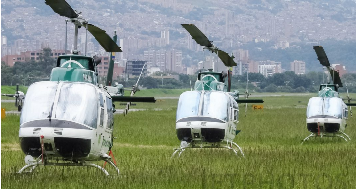
Bell 407 Windshield Heatshields

Heatshields are interior sunshades for an aircraft's windows or canopy glass. The product is a unique composite of closed-cell foam with a silver mylar finish. The semi-rigid design is stiff enough to stand along the inside of the windshield using sun visors or window framing. It folds up flat and easily stores in the included storage sleeve. Some designs may require velcro and suction cups. A Heatshield is an excellent short-term remedy for cockpit overheating.