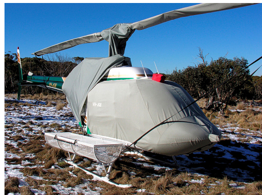
JetRanger Bubble, Engine, Rotor Hub & Blade Covers (& Tie-Downs)