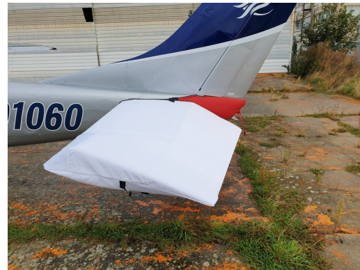
Cessna 207 Tailcone Cover, Horizontal Stab. Cover (test fit)