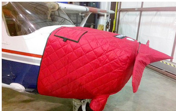
Cessna 172 Insulated Engine Cover w/ Oil Filler Door flap and Insulated Prop/Spinner Cover