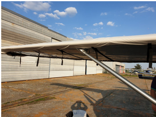
Cessna 207 Wing Covers

WINTER USE MATERIAL - Made with Solution-Dyed Polyester fabric, this option is intended for seasonal use to aid in deicing, rain mitigation, or for occasional travel. The material is lighter and more compact, but more susceptible to UV damage and may have a shorter useful life if used continuously outside than the all-year use material.