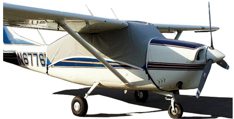
Cessna 206 Standard Canopy Cover