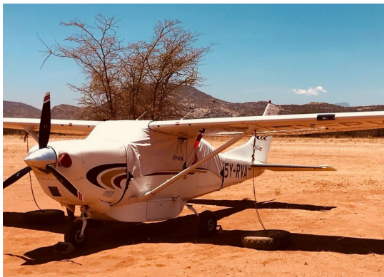
Cessna 206 Canopy Cover

This cover type is made from Silver Acrylic Sunbrella canvas and is 100% lined with a soft and smooth microfiber. Bruce's Custom Covers developed this material combination especially for aircraft protection. The outer material is medium weight and treated for water resistance, UV resistance and anti-static buildup. The inner lining is a very soft and smooth microfiber to prevent scratching. The material is very reflective, and tests show that the cabin interior temperature can be reduced to near-ambient temperature on the hottest of days. It is water, ice and snow repellent, yet breathable to allow moisture to escape from between the cover and the aircraft surface.