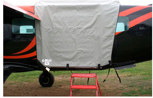
Cessna 208 Caravan Jump Door Cover