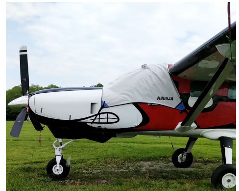
Cessna Caravan 208A Cockpit Cover