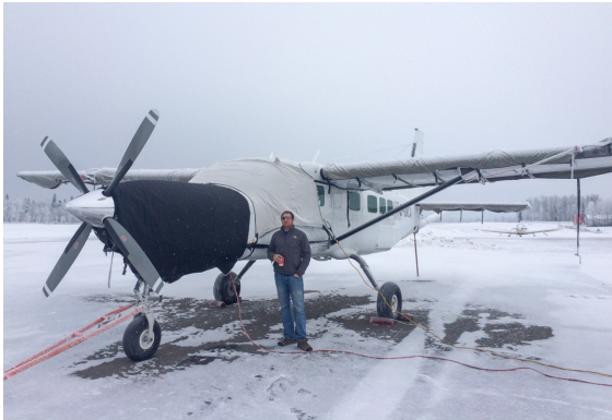
Cessna 208 Caravan Insulated Engine, Cockpit & Wing Covers

This cover type is made from Silver Acrylic Sunbrella canvas and is 100% lined with a soft and smooth microfiber. Bruce's Custom Covers developed this material combination especially for aircraft protection. The outer material is medium weight and treated for water resistance, UV resistance and anti-static buildup. The inner lining is a very soft and smooth microfiber to prevent scratching. The material is very reflective, and tests show that the cabin interior temperature can be reduced to near-ambient temperature on the hottest of days. It is water, ice and snow repellent, yet breathable to allow moisture to escape from between the cover and the aircraft surface.