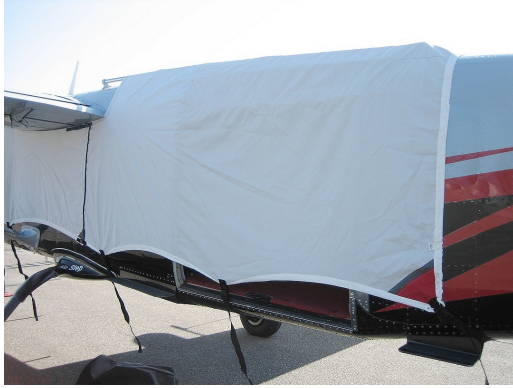
Cessna Caravan Canopy Cover

The material is very reflective, and tests show that the cabin interior temperature can be reduced to near-ambient temperature on the hottest of days. It is water, ice and snow repellent, yet breathable to allow moisture to escape from between the cover and the aircraft surface.