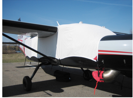
Cessna Caravan Canopy Cover