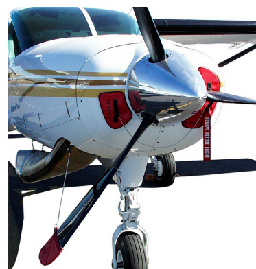
Cessna 208 Caravan Engine Plugs & Prop Tie