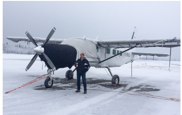
Cessna 208 Caravan Wrap-Around Canopy Cover, Wing Covers Cessna 208 Caravan Insulated Engine, Cockpit & Wing Covers