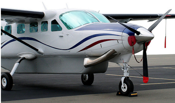
Cessna Caravan Windshield HeatShield, Plugs, Prop Ties & Pitot Cover

Heatshields are interior sunshades for an aircraft's windows or canopy glass. The product is a unique composite of closed-cell foam with a silver mylar finish. The semi-rigid design is stiff enough to stand along the inside of the windshield using sun visors or window framing. It folds up flat and easily stores in the included storage sleeve. Some designs may require velcro and suction cups. A Heatshield is an excellent short-term remedy for cockpit overheating.