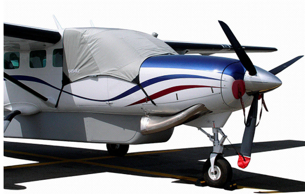
Cessna Caravan Windshield Cover, Plugs, Prop Ties & Pitot Cover