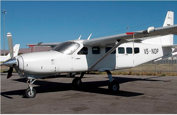
Cessna 208 Caravan Windshield HeatShield

Heatshields are interior sunshades for an aircraft's windows or canopy glass. The product is a unique composite of closed-cell foam with a silver mylar finish. The semi-rigid design is stiff enough to stand along the inside of the windshield using sun visors or window framing. It folds up flat and easily stores in the included storage sleeve. Some designs may require velcro and suction cups. A Heatshield is an excellent short-term remedy for cockpit overheating.