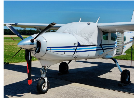
Cessna Caravan 208A Cockpit Cover