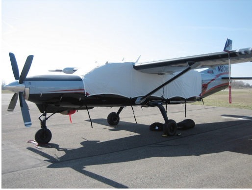
Cessna Caravan Canopy Cover

The material is very reflective, and tests show that the cabin interior temperature can be reduced to near-ambient temperature on the hottest of days. It is water, ice and snow repellent, yet breathable to allow moisture to escape from between the cover and the aircraft surface.