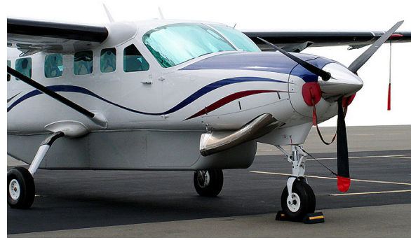
Cessna Caravan Windshield HeatShield, Plugs, Prop Ties & Pitot Cover