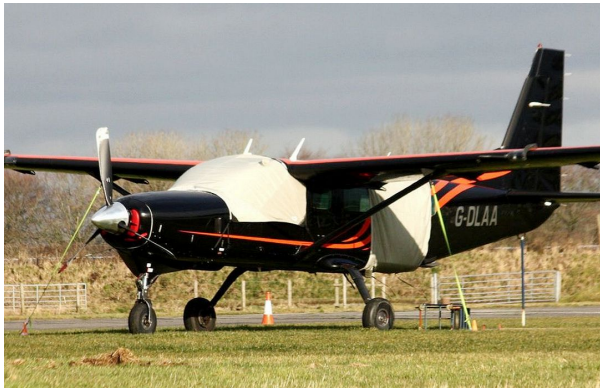
Cessna Caravan Cockpit Cover, Engine Plugs, Jump Door Cover