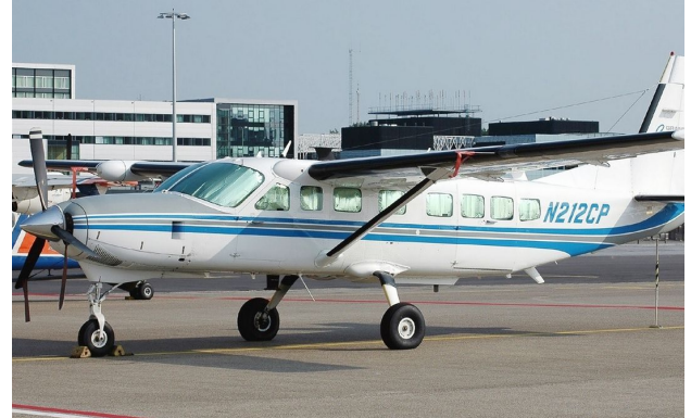
Cessna 208 Caravan, U-27A, AC-208 Heatshield Set (208a Models)