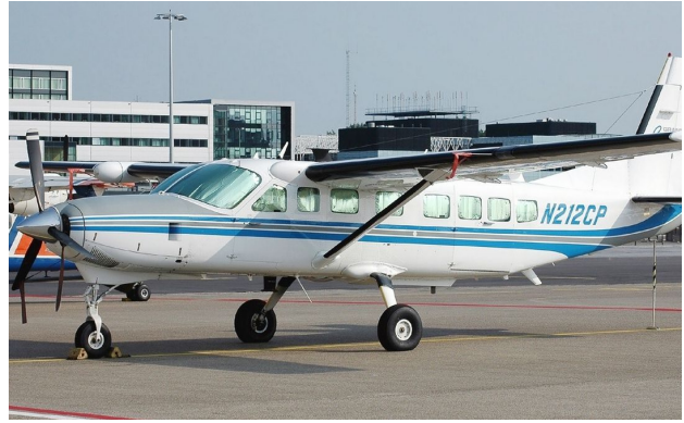
Cessna 208 Caravan, U-27A, AC-208 Heatshield Set (208a Models)