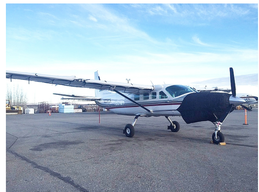
Cessna 208 Caravan Insulated Engine Cover, fully enclosed