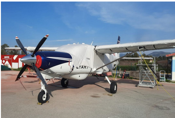
Cessna 208 Caravan Wrap-Around Canopy Cover, Wing Covers

WINTER USE MATERIAL - Made with Solution-Dyed Polyester fabric, this option is intended for seasonal use to aid in deicing, rain mitigation, or for occasional travel. The material is lighter and more compact, but more susceptible to UV damage and may have a shorter useful life if used continuously outside than the all-year use material.