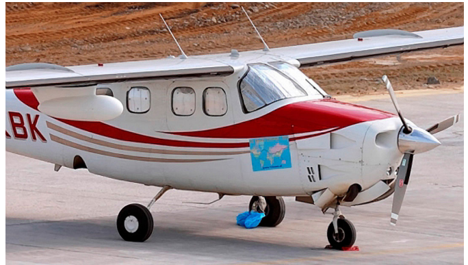
Cessna P210 HeatShield Set