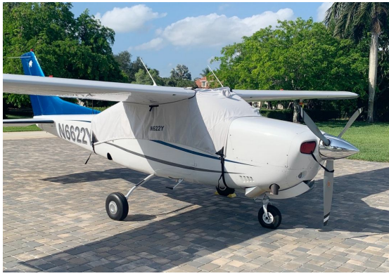
Cessna 210 Canopy Cover, Wrap-Around Type