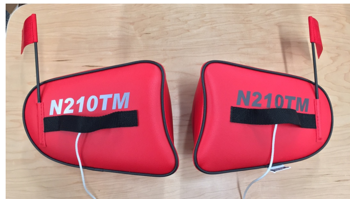
Cessna 210 Engine Inlet Plugs