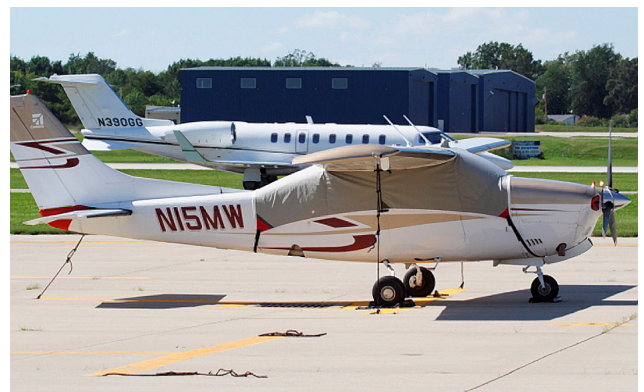
Cessna 210 Canopy Cover, Engine Plugs, Tailcone Cover