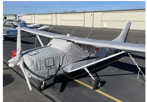
Cessna 210 Winter Cover Set