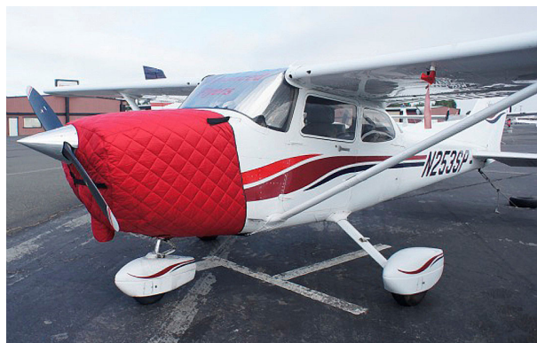
Cessna 172 Insulated Engine Cover, fully enclosed

Windshield Heatshields are interior sunshades for an aircraft's front windshield. The product is a unique composite of closed-cell foam with a silver mylar finish. The semi-rigid design is stiff enough to stand along the inside of the windshield using sun visors or window framing. It folds up flat and easily stores in the included storage sleeve. Some designs may require velcro and suction cups or split right and left sides. A Heatshield is an excellent short-term remedy for cockpit overheating. An external fabric cover is far more effective and practical for long-term protection.