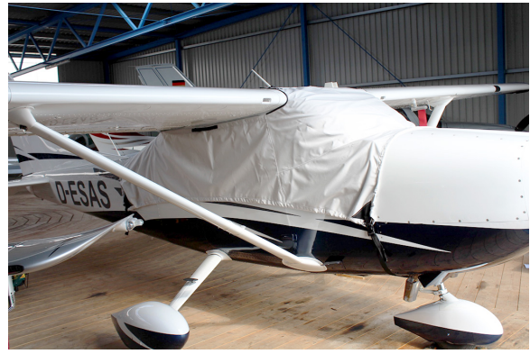
Cessna 206 Stationair Canopy Cover, Wrap-Around