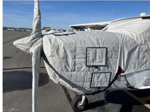
Cessna 210 Winter Cover Set