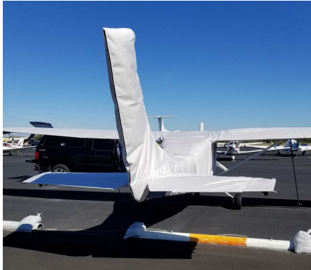
Cessna 210B Empennage Cover

WINTER USE MATERIAL - Made with Solution-Dyed Polyester fabric, this option is intended for seasonal use to aid in deicing, rain mitigation, or for occasional travel. The material is lighter and more compact, but more susceptible to UV damage and may have a shorter useful life if used continuously outside than the all-year use material.