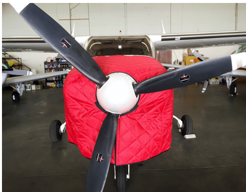
FOR INTERIOR USE. Cessna 210 Insulated Hangar Blanket, available in Red or Silver

This cover type is made from Silver Acrylic Sunbrella canvas and is 100% lined with a soft and smooth microfiber. Bruce's Custom Covers developed this material combination especially for aircraft protection. The outer material is medium weight and treated for water resistance, UV resistance and anti-static buildup. The inner lining is a very soft and smooth microfiber to prevent scratching. The material is very reflective, and tests show that the cabin interior temperature can be reduced to near-ambient temperature on the hottest of days. It is water, ice and snow repellent, yet breathable to allow moisture to escape from between the cover and the aircraft surface.