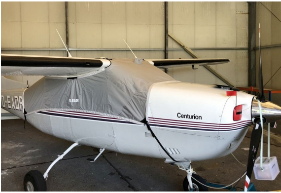
Cessna 210 Travel Weight Canopy Cover