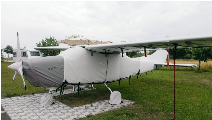
Cessna 210 Complete Cover Set

WINTER USE MATERIAL - Made with Solution-Dyed Polyester fabric, this option is intended for seasonal use to aid in deicing, rain mitigation, or for occasional travel. The material is lighter and more compact, but more susceptible to UV damage and may have a shorter useful life if used continuously outside than the all-year use material.