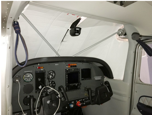
Cessna 180 Skywagon Windshield Heatshield, (W/ Compass)

Windshield Heatshields are interior sunshades for an aircraft's front windshield. The product is a unique composite of closed-cell foam with a silver mylar finish. The semi-rigid design is stiff enough to stand along the inside of the windshield using sun visors or window framing. It folds up flat and easily stores in the included storage sleeve. Some designs may require velcro and suction cups or split right and left sides. A Heatshield is an excellent short-term remedy for cockpit overheating. An external fabric cover is far more effective and practical for long-term protection.