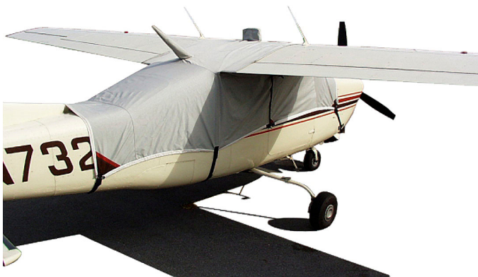
Cessna 210 Over-Top Canopy Cover w/baggage door extension

Travel Covers are made with Silver Solution-Dyed Polyester fabric and only lined over the windshield to save weight. The material is lightweight and more compact for easy stowage in the aircraft. The polyester material is water resistant, but only intended for occasional use outside. We also have an ultra lightweight material available for fitted hangar dust covers. For daily outdoor use, the non-travel Sunbrella Cover is the best choice.