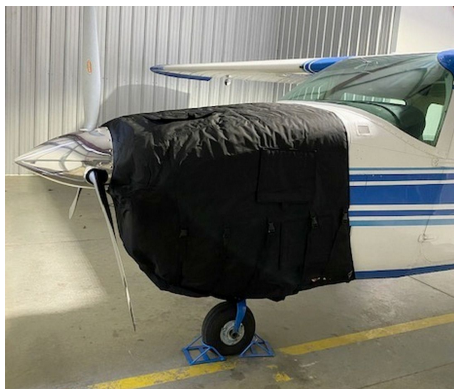
Cessna T210L Insulated Engine Cover

This cover type is made from Silver Acrylic Sunbrella canvas and is 100% lined with a soft and smooth microfiber. Bruce's Custom Covers developed this material combination especially for aircraft protection. The outer material is medium weight and treated for water resistance, UV resistance and anti-static buildup. The inner lining is a very soft and smooth microfiber to prevent scratching. The material is very reflective, and tests show that the cabin interior temperature can be reduced to near-ambient temperature on the hottest of days. It is water, ice and snow repellent, yet breathable to allow moisture to escape from between the cover and the aircraft surface.