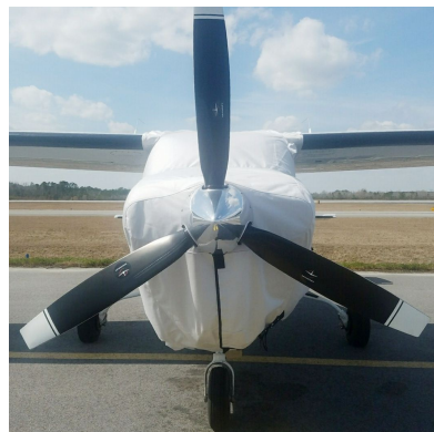
Cessna 210 Canopy Cover, Extends to Cover Baggage Door Cessna 210 Over-Top Canopy Cover, Fully Enclosed Engine Cover