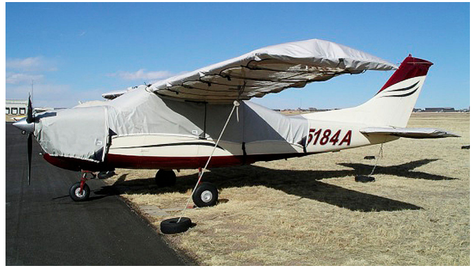
Cessna 210 Engine, Canopy Cover w/ Baggage Door ext. & Wing Covers