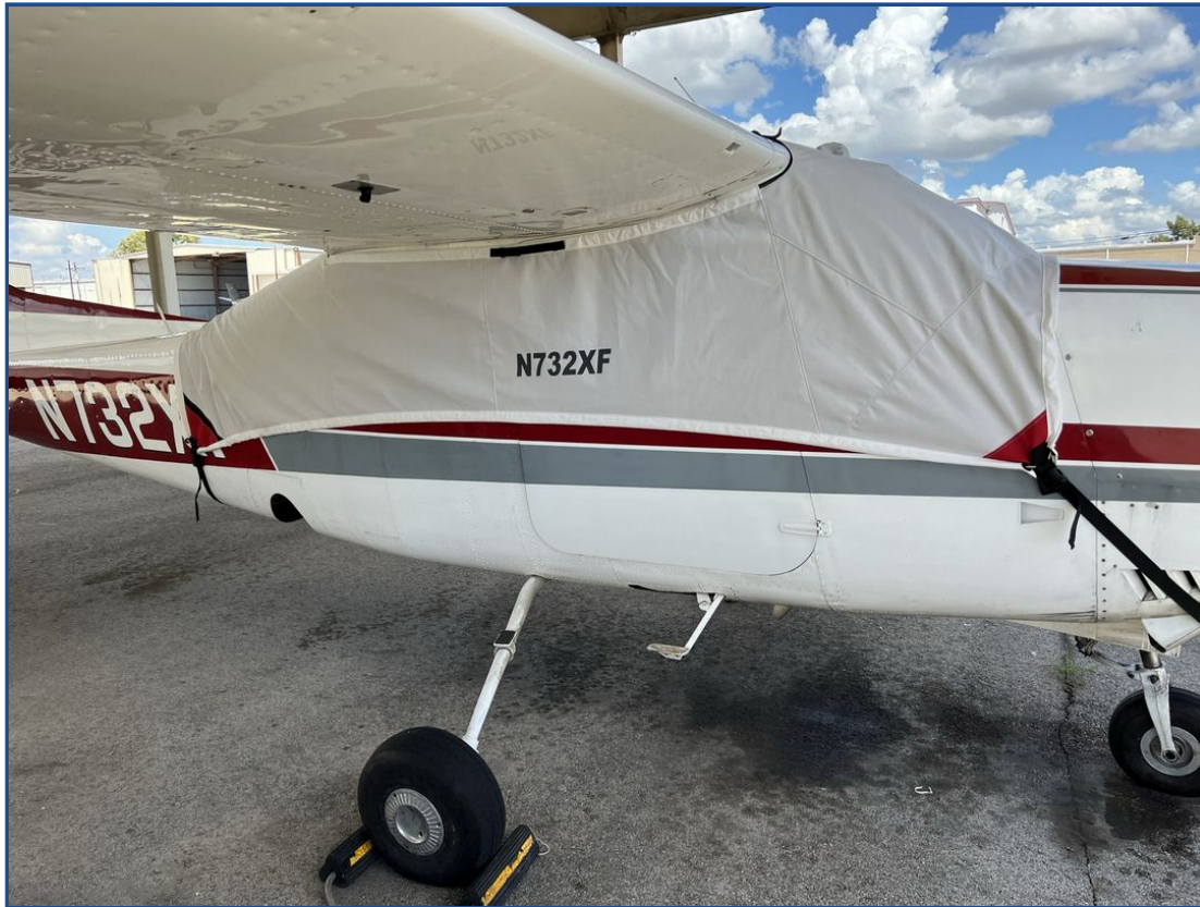
Cessna T210M Canopy Cover