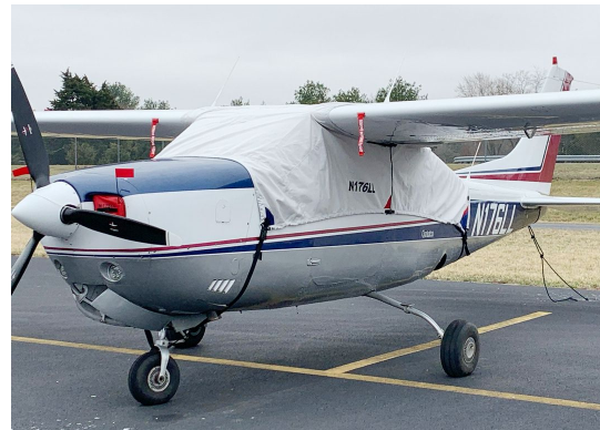
Cessna 210L Over The Top Style Canopy Cover