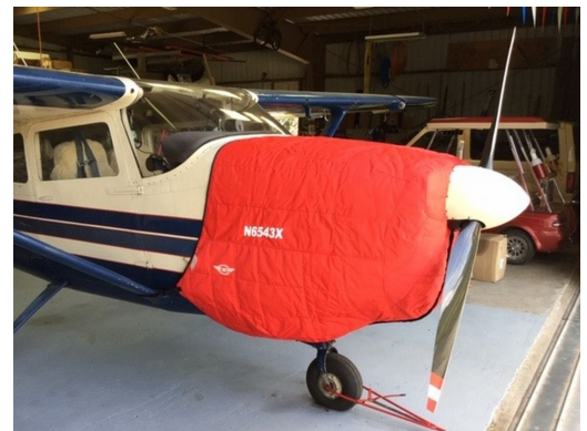
Cessna 210 Insulated Engine Cover