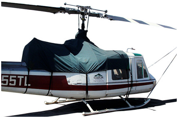
Bell 204/205 Engine/Mid-Cabin Cover

WINTER USE MATERIAL - Made with Solution-Dyed Polyester fabric, this option is intended for seasonal use to aid in deicing, rain mitigation, or for occasional travel. The material is lighter and more compact, but more susceptible to UV damage and may have a shorter useful life if used continuously outside than the all-year use material.