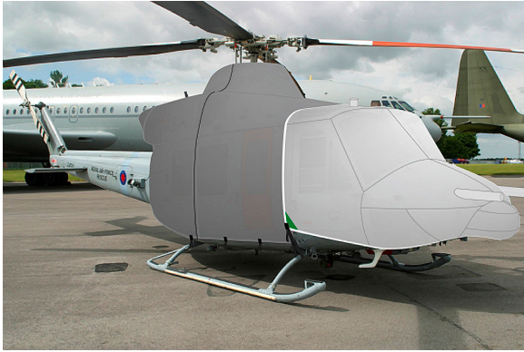
Forward Cabin Nose & Mid-Cabin/Engine Cover (extended to cross tubes)

This cover type is made from Silver Acrylic Sunbrella canvas and is 100% lined with a soft and smooth microfiber. Bruce's Custom Covers developed this material combination especially for aircraft protection. The outer material is medium weight and treated for water resistance, UV resistance and anti-static buildup. The inner lining is a very soft and smooth microfiber to prevent scratching. The material is very reflective, and tests show that the cabin interior temperature can be reduced to near-ambient temperature on the hottest of days. It is water, ice and snow repellent, yet breathable to allow moisture to escape from between the cover and the aircraft surface.