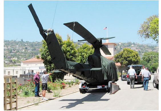
Bell 204/205 Full Body Cover Set