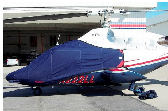
Bell 222 Bubble Cover