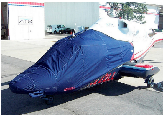
Bell 222 Bubble Cover

This cover type is made from Silver Acrylic Sunbrella canvas and is 100% lined with a soft and smooth microfiber. Bruce's Custom Covers developed this material combination especially for aircraft protection. The outer material is medium weight and treated for water resistance, UV resistance and anti-static buildup. The inner lining is a very soft and smooth microfiber to prevent scratching. The material is very reflective, and tests show that the cabin interior temperature can be reduced to near-ambient temperature on the hottest of days. It is water, ice and snow repellent, yet breathable to allow moisture to escape from between the cover and the aircraft surface.