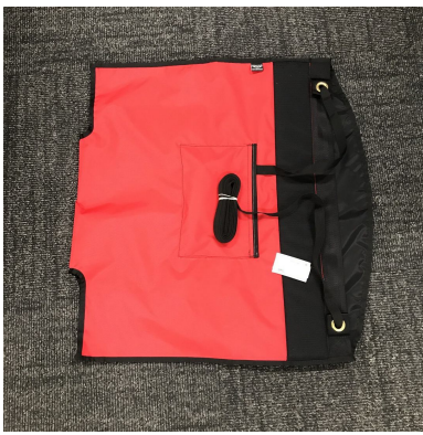
Bell 230 Blade Tie-Downs, (Semi-Rigid) W/Telescoping Attachment Handle