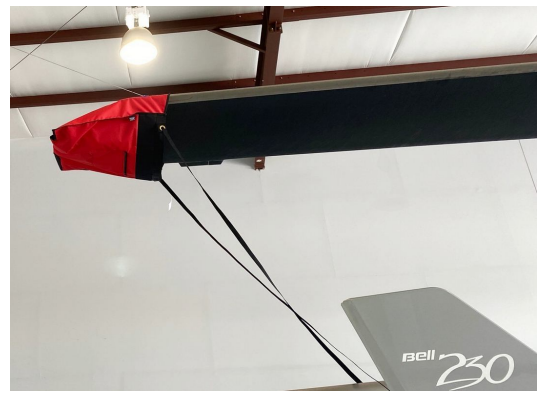
Bell 230 Blade Tie-Downs, (Semi-Rigid) W/Telescoping Attachment Handle