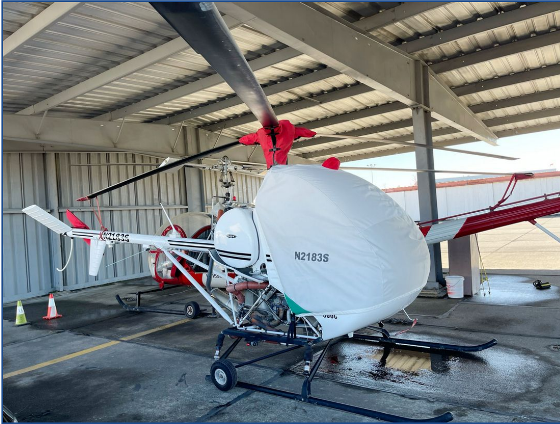
Schweizer 300C Bubble, Main &amp; Tail Rotor Covers