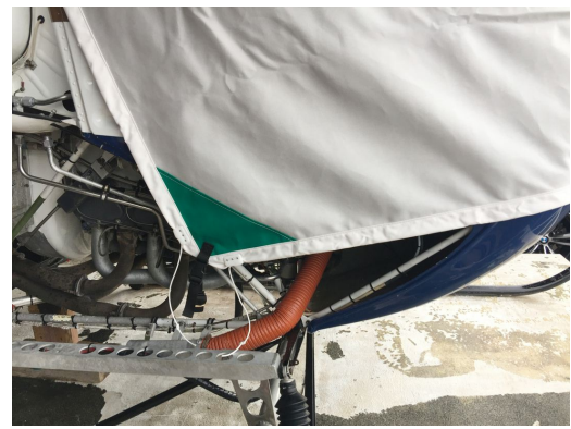
Hughes/Schweizer 300C Bubble Cover