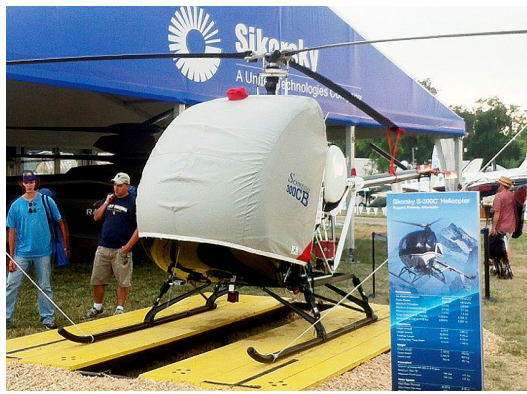
Schweizer 300CB Bubble Cover