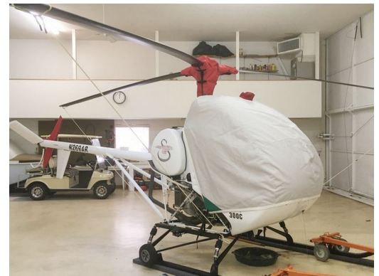
Schweizer 269C Bubble cover