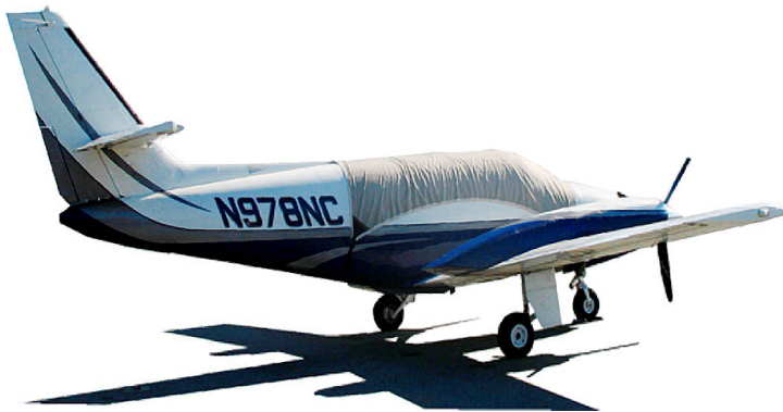
Cessna 303 Crusader Canopy Cover

Travel Covers are made with Silver Solution-Dyed Polyester fabric and only lined over the windshield to save weight. The material is lightweight and more compact for easy stowage in the aircraft. The polyester material is water resistant, but only intended for occasional use outside. We also have an ultra lightweight material available for fitted hangar dust covers. For daily outdoor use, the non-travel Sunbrella Cover is the best choice.