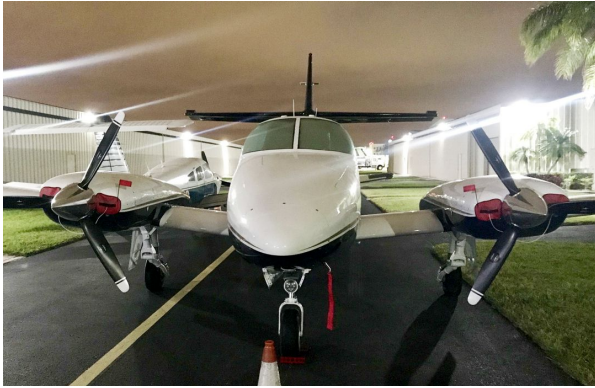
Cessna T303 Crusader Engine Inlet Plugs

single block of sculpted urethane foam. Each plug has a zipper that allows the foam to be removed and dried if necessary. Engine plugs have warning flags that are visible from the cockpit or 'remove before flight' streamers sewn onto the face of the plugs. Most plugs are imprinted with the aircraft registration number in black for an extra charge. Storage bag NOT included. Engine plugs may be inserted after flight when the engine is still warm. Engine Inlet Plugs are commonly referred to as Cowl Plugs, Intake Plugs, Cowl Blocks, Engine Blocks, and Engine Bungs.