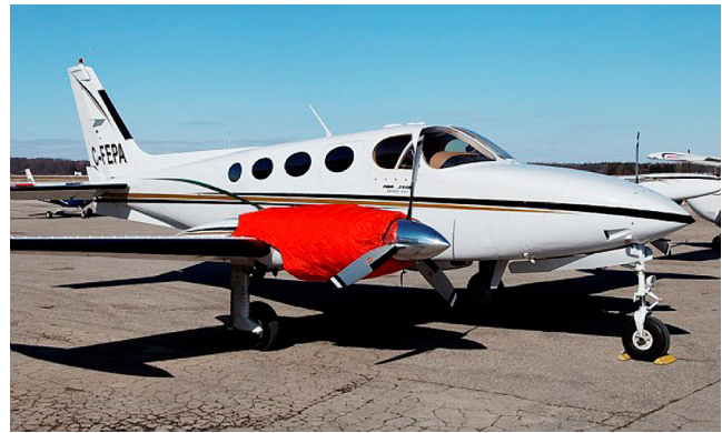
Cessna 340 Insulated Engine Covers