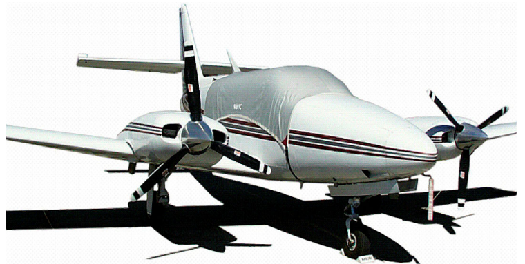
Cessna Crusader Standard Canopy Cover