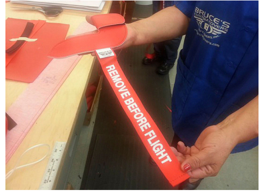
Cessna 150 Pitot Cover