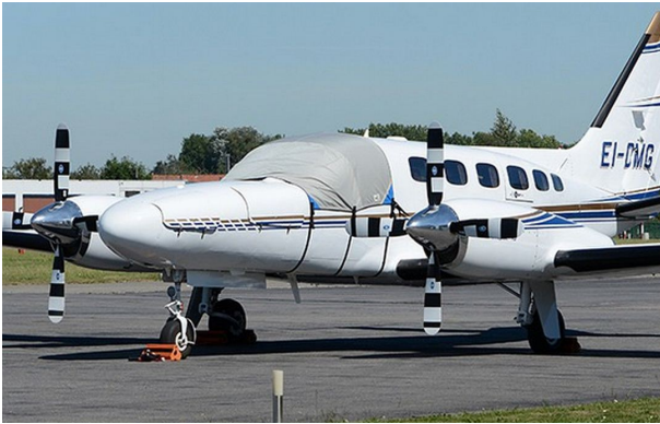
Cessna 441 Cockpit Cover

This cover type is made from Silver Acrylic Sunbrella canvas and is 100% lined with a soft and smooth microfiber. Bruce's Custom Covers developed this material combination especially for aircraft protection. The outer material is medium weight and treated for water resistance, UV resistance and anti-static buildup. The inner lining is a very soft and smooth microfiber to prevent scratching. The material is very reflective, and tests show that the cabin interior temperature can be reduced to near-ambient temperature on the hottest of days. It is water, ice and snow repellent, yet breathable to allow moisture to escape from between the cover and the aircraft surface.