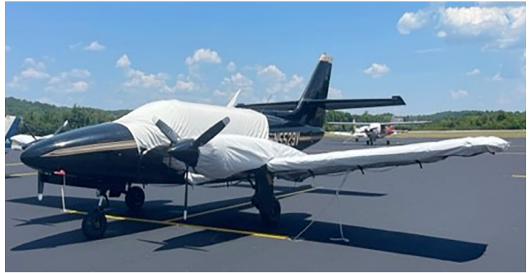
Cessna T303 Crusader Canopy Cover