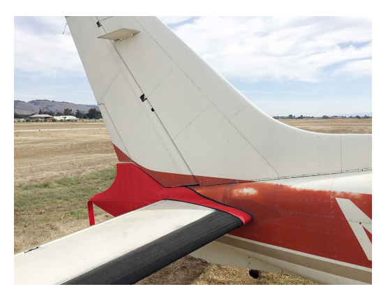
Cessna 310 Tailcone Cover

WINTER USE MATERIAL - Made with Solution-Dyed Polyester fabric, this option is intended for seasonal use to aid in deicing, rain mitigation, or for occasional travel. The material is lighter and more compact, but more susceptible to UV damage and may have a shorter useful life if used continuously outside than the all-year use material.