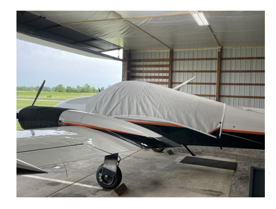
Cessna 310K Canopy & Insulated Engine Covers

This cover type is made from Silver Acrylic Sunbrella canvas and is 100% lined with a soft and smooth microfiber. Bruce's Custom Covers developed this material combination especially for aircraft protection. The outer material is medium weight and treated for water resistance, UV resistance and anti-static buildup. The inner lining is a very soft and smooth microfiber to prevent scratching. The material is very reflective, and tests show that the cabin interior temperature can be reduced to near-ambient temperature on the hottest of days. It is water, ice and snow repellent, yet breathable to allow moisture to escape from between the cover and the aircraft surface.