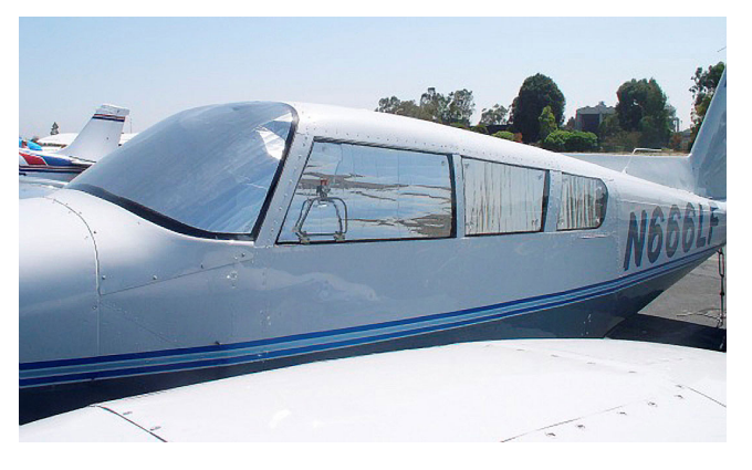
Piper PA-30 Twin Comanche Cockpit HeatShields