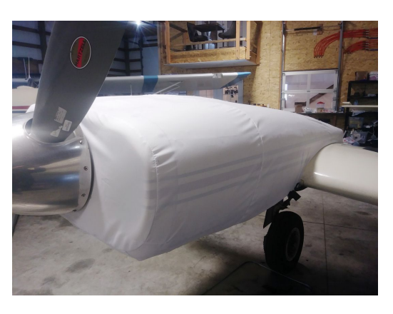
Cessna 310B Engine Covers, test fit cover