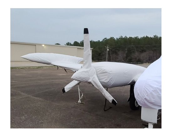
Cessna 310Q Wing/Engine Covers, Prop Covers