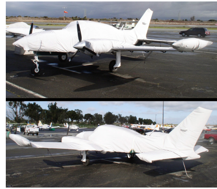
Cessna 310 Complete Cover Set