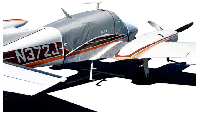
Cessna 320 Canopy Cover