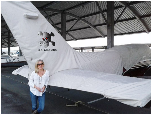
Cessna 310R Empennage Cover