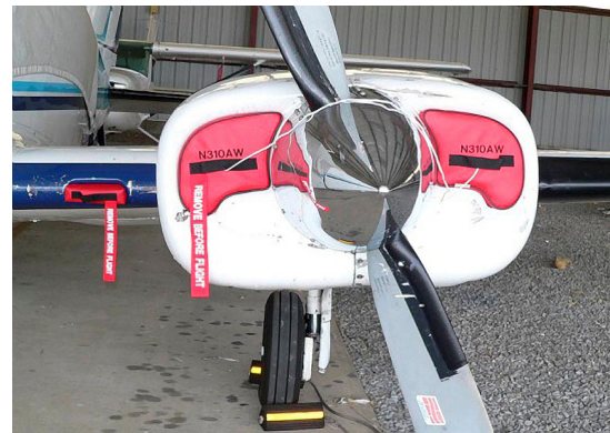
Cessna 310P Engine Inlet and Center Section Inlet Plugs