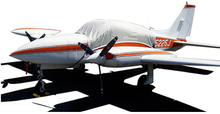
Cessna 310Q Canopy Cover