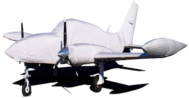
Cessna 310 Complete Cover Set