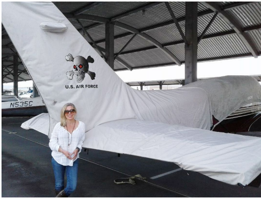
Cessna 310R Empennage Cover