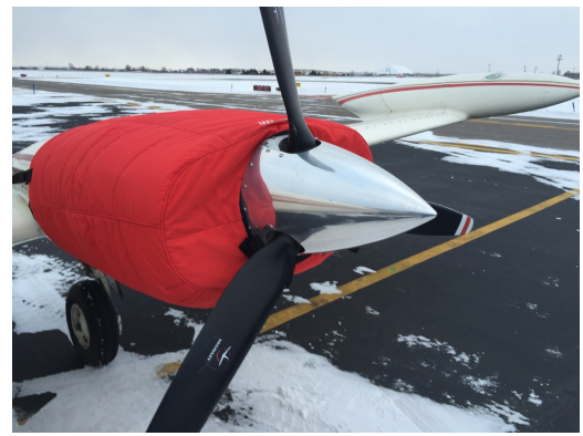
Cessna 310 Insulated Engine Cover