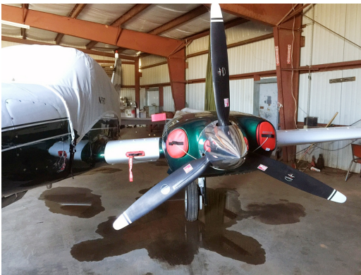
Cessna 310 Engine and Center Section Plugs

Engine Inlet Plugs are custom fit for your Cessna 320 intakes, made with heavy-duty vinyl material, and stuffed with a single block of sculpted urethane foam. Each plug has a zipper that allows the foam to be removed and dried if necessary. Engine plugs have warning flags that are visible from the cockpit or 'remove before flight' streamers sewn onto the face of the plugs. Most plugs are imprinted with the aircraft registration number in black for an extra charge. Storage bag NOT included. Engine plugs may be inserted after flight when the engine is still warm. Engine Inlet Plugs are commonly referred to as Cowl Plugs, Intake Plugs, Cowl Blocks, Engine Blocks, and Engine Bungs.