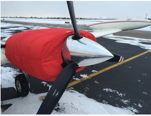
Cessna 310 Insulated Engine Cover