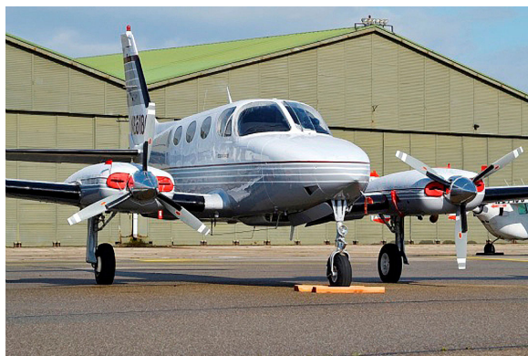
Cessna 340 Engine Plugs

Engine Inlet Plugs are custom fit for your Cessna 320 intakes, made with heavy-duty vinyl material, and stuffed with a single block of sculpted urethane foam. Each plug has a zipper that allows the foam to be removed and dried if necessary. Engine plugs have warning flags that are visible from the cockpit or 'remove before flight' streamers sewn onto the face of the plugs. Most plugs are imprinted with the aircraft registration number in black for an extra charge. Storage bag NOT included. Engine plugs may be inserted after flight when the engine is still warm. Engine Inlet Plugs are commonly referred to as Cowl Plugs, Intake Plugs, Cowl Blocks, Engine Blocks, and Engine Bungs.