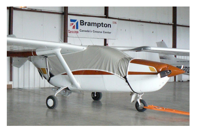
Cessna 337 Skymaster Canopy Cover w/15" Bib

Cessna Skymaster Canopy Cover w/ 14" bib ext.