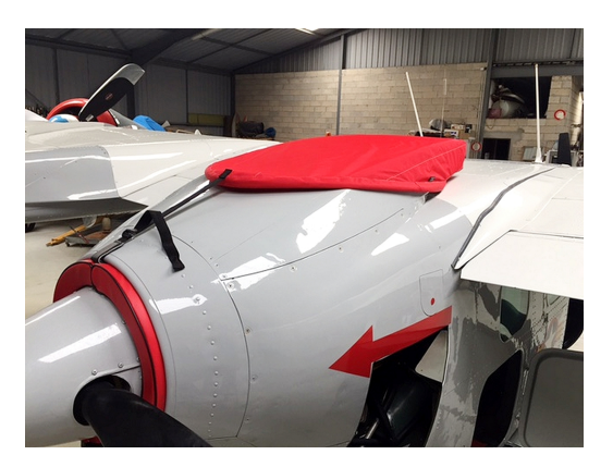
Cessna 337 Skymaster Aft Engine Inlet Cover, hoop type, & outlet plugs (SOLD SEPARATELY)