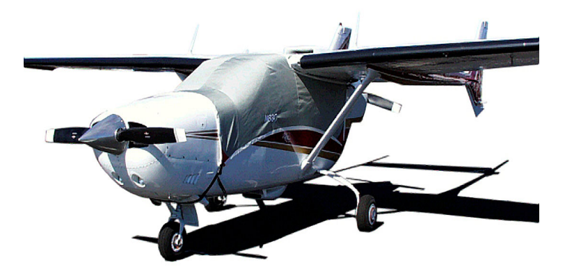
Cessna Skymaster Canopy Cover with Forward Extension, Fwd. Engine Plugs, Aft Engine Cover