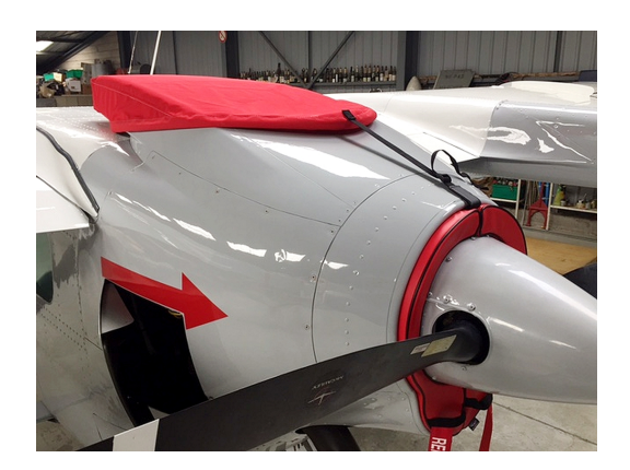
Cessna 337 Skymaster Aft Engine Inlet Cover, hoop type, & outlet plugs (SOLD SEPARATELY)

Engine Inlet Plugs are custom fit for your Cessna 336 (Fixed Gear Skymaster) intakes, made with heavy-duty vinyl material, and stuffed with a single block of sculpted urethane foam. Each plug has a zipper that allows the foam to be removed and dried if necessary. Engine plugs have warning flags that are visible from the cockpit or 'remove before flight' streamers sewn onto the face of the plugs. Most plugs are imprinted with the aircraft registration number in black for an extra charge. Storage bag NOT included. Engine plugs may be inserted after flight when the engine is still warm. Engine Inlet Plugs are commonly referred to as Cowl Plugs, Intake Plugs, Cowl Blocks, Engine Blocks, and Engine Bungs.