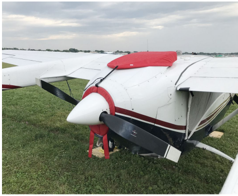
Cessna 337 Skymaster Aft Engine Inlet Cover, Rear Engine Plugs (SOLD SEPARATELY)