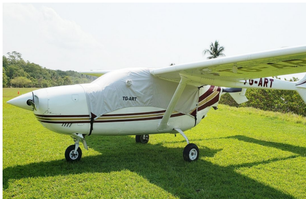
Cessna 337 Skymaster Canopy Cover w/14" Bib Extension

This cover type is made from Silver Acrylic Sunbrella canvas and is 100% lined with a soft and smooth microfiber. Bruce's Custom Covers developed this material combination especially for aircraft protection. The outer material is medium weight and treated for water resistance, UV resistance and anti-static buildup. The inner lining is a very soft and smooth microfiber to prevent scratching. The material is very reflective, and tests show that the cabin interior temperature can be reduced to near-ambient temperature on the hottest of days. It is water, ice and snow repellent, yet breathable to allow moisture to escape from between the cover and the aircraft surface.