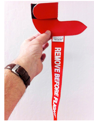
Standard Pitot Cover