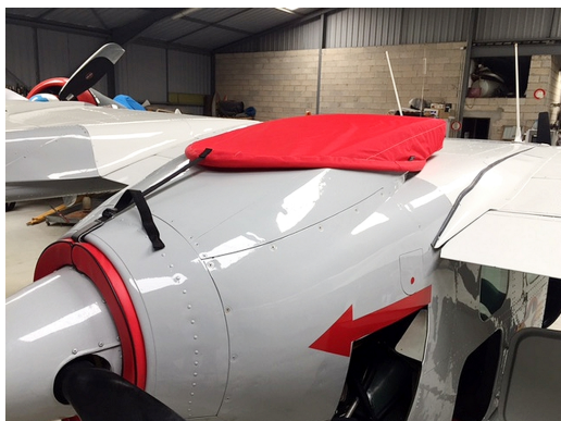
Cessna 337 Skymaster Aft Engine Inlet Cover, hoop type, & outlet plugs (SOLD SEPARATELY)

This cover type is made from Silver Acrylic Sunbrella canvas and is 100% lined with a soft and smooth microfiber. Bruce's Custom Covers developed this material combination especially for aircraft protection. The outer material is medium weight and treated for water resistance, UV resistance and anti-static buildup. The inner lining is a very soft and smooth microfiber to prevent scratching. The material is very reflective, and tests show that the cabin interior temperature can be reduced to near-ambient temperature on the hottest of days. It is water, ice and snow repellent, yet breathable to allow moisture to escape from between the cover and the aircraft surface.