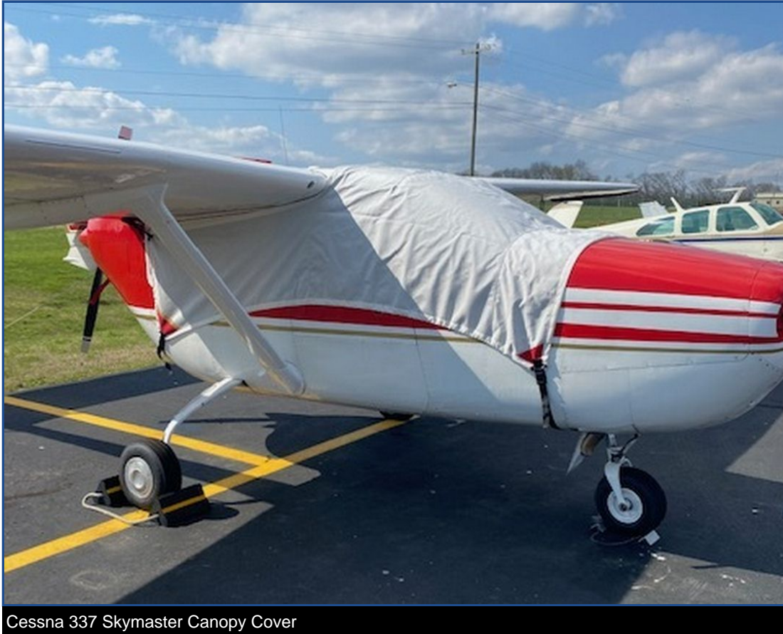
Cessna 337 Skymaster Canopy Cover