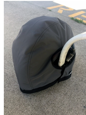
Cessna 337 Skymaster (O-2, O-2A) Tire Covers