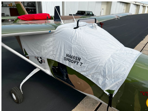
Cessna 337 Skymaster Canopy Cover with 14" bib ext.

This cover type is made from Silver Acrylic Sunbrella canvas and is 100% lined with a soft and smooth microfiber. Bruce's Custom Covers developed this material combination especially for aircraft protection. The outer material is medium weight and treated for water resistance, UV resistance and anti-static buildup. The inner lining is a very soft and smooth microfiber to prevent scratching. The material is very reflective, and tests show that the cabin interior temperature can be reduced to near-ambient temperature on the hottest of days. It is water, ice and snow repellent, yet breathable to allow moisture to escape from between the cover and the aircraft surface.