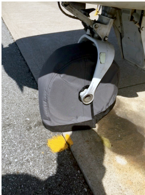
Cessna 337 Skymaster (O-2, O-2A) Tire Covers

ALL-YEAR USE MATERIAL - Made with Silver Acrylic Sunbrella canvas, the all-year use material is the best option for sun protection and cover longevity. This heavier more durable material is intended for all weather conditions, such as rain and snow or lots of sun.