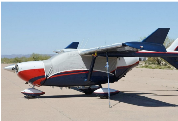
Canopy Cover with Forward Extension

This cover type is made from Silver Acrylic Sunbrella canvas and is 100% lined with a soft and smooth microfiber. Bruce's Custom Covers developed this material combination especially for aircraft protection. The outer material is medium weight and treated for water resistance, UV resistance and anti-static buildup. The inner lining is a very soft and smooth microfiber to prevent scratching. The material is very reflective, and tests show that the cabin interior temperature can be reduced to near-ambient temperature on the hottest of days. It is water, ice and snow repellent, yet breathable to allow moisture to escape from between the cover and the aircraft surface.