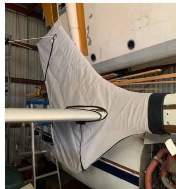
Cessna 337 Skymaster Vertical Stabilizer Covers