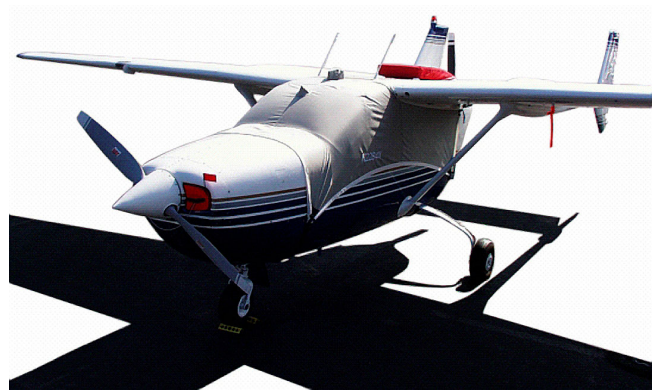
Cessna 337 Skymaster Canopy Cover w/ 14" bib ext.