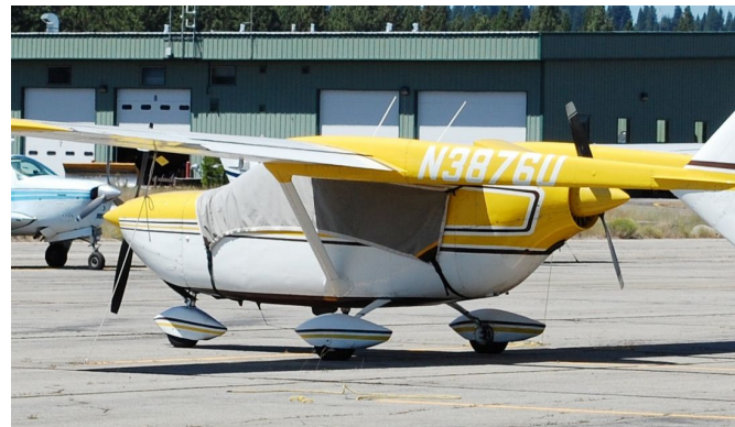
Cessna 337 & 336 Skymaster Canopy Cover with 14" front bib extension.