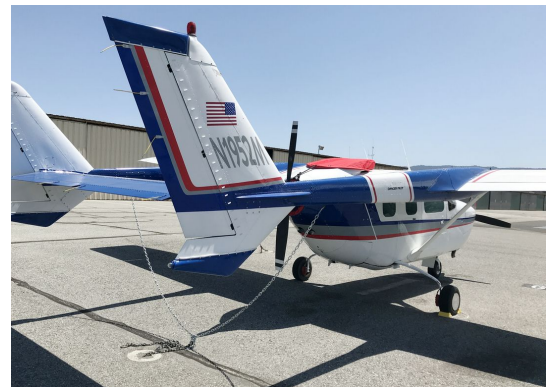
Cessna Skymaster 337G Rear Engine Inlet Cover