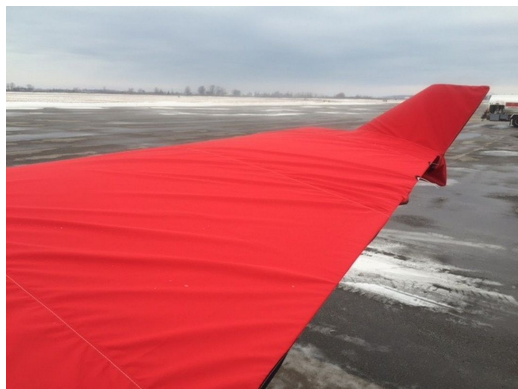
Cessna 337 Skymaster Wing Covers, with winglets

WINTER USE MATERIAL - Made with Solution-Dyed Polyester fabric, this option is intended for seasonal use to aid in deicing, rain mitigation, or for occasional travel. The material is lighter and more compact, but more susceptible to UV damage and may have a shorter useful life if used continuously outside than the all-year use material.