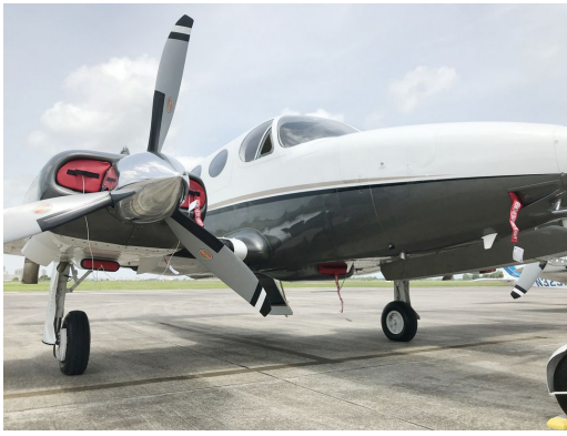
Cessna 340A Engine Plugs