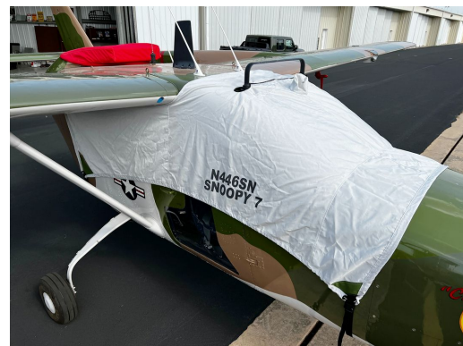
Cessna 337 Skymaster Canopy Cover with 14" bib ext.