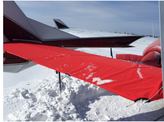
Cessna 337 Skymaster Horizontal Stabilizer Cover