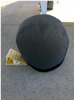
Cessna 337 Skymaster (O-2, O-2A) Tire Covers

ALL-YEAR USE MATERIAL - Made with Silver Acrylic Sunbrella canvas, the all-year use material is the best option for sun protection and cover longevity. This heavier more durable material is intended for all weather conditions, such as rain and snow or lots of sun.