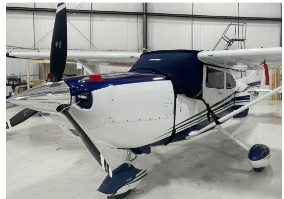
Cessna 182 Windshield Cover, Engine Plugs