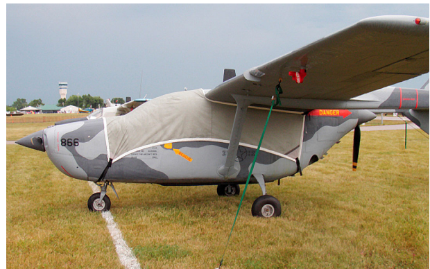
Cessna Skymaster Canopy Cover with Forward Extension Cessna 337 Skymaster Canopy Cover w/ 14" bib ext. & Pitot Cover Set