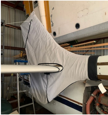
Cessna 337 Skymaster Vertical Stabilizer Covers

WINTER USE MATERIAL - Made with Solution-Dyed Polyester fabric, this option is intended for seasonal use to aid in deicing, rain mitigation, or for occasional travel. The material is lighter and more compact, but more susceptible to UV damage and may have a shorter useful life if used continuously outside than the all-year use material.