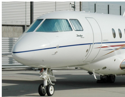
Hawker Beechcraft 4000 Horizon Cockpit Heatshields