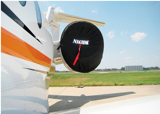
Hawker 4000 Intake Cover

The Hawker Beechcraft 4000 Horizon Intake Covers are designed to install easily yet be completely storable. A spring steel hoop is sewn into the hem of each cover, allowing them to be installed without climbing onto the wing or using a stepladder. To store the covers the spring steel hoop folds like a band-saw blade into three nesting rings. Each cover folds into a compact circular bundle which is stored in the included duffle bag, yet they unfold quickly for use. The Tri-Fold Ring cover is made of medium weight nylon which is available in a variety of colors to match the paint trim. Each cover set comes complete with installation and folding instructions. The aircraft's registration number can be silkscreened onto the cover for an extra charge.