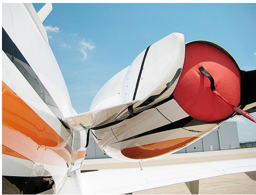
Hawker 4000 Exhaust Plug