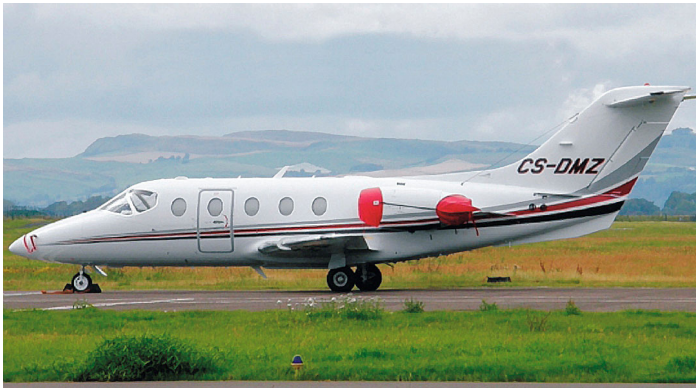
Beechjet 400 Engine & Pitot Covers