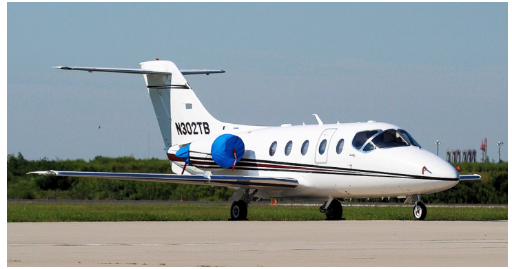
Nextant 400XTi Engine Covers in Blue