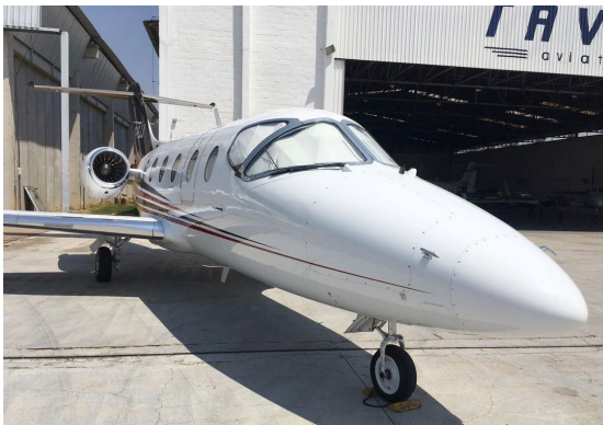
Beechjet Cockpit Heatshields

Cockpit Heatshields are interior sunshades for the aircraft's cockpit. The product is a unique composite of closed-cell foam with a silver mylar finish. The semi-rigid design is stiff enough to stand inside the window framing. The set folds up flat and is easily stored in the included storage sleeve. Some designs may require velcro and suction cups. Our Heatshields for jets are offered white side out because some aircraft manufacturers have issued advisories against reflective window inserts due to potential heat damage. A Heatshield is an excellent short-term remedy for cockpit overheating, but an external fabric cover is more effective for long-term protection.