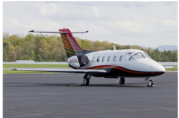
Nextant 400XTi Cockpit HeatShields, Bikini Type Engine Covers