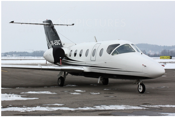
Nextant 400XTi Bikini Type Engine Covers