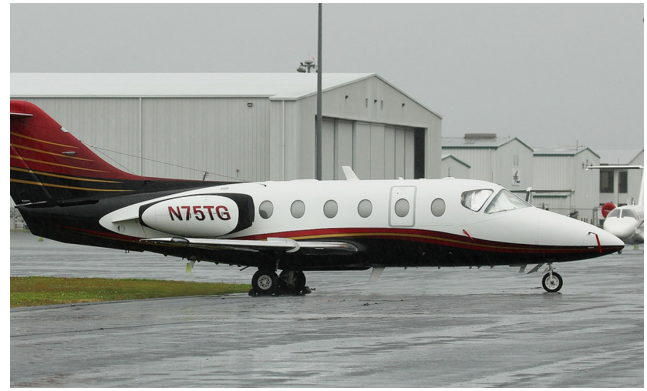
Nextant 400XTi Cockpit HeatShields, Bikini Type Engine Covers