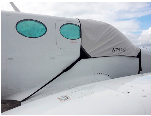
Cessna 340 Cockpit/Windshield Cover