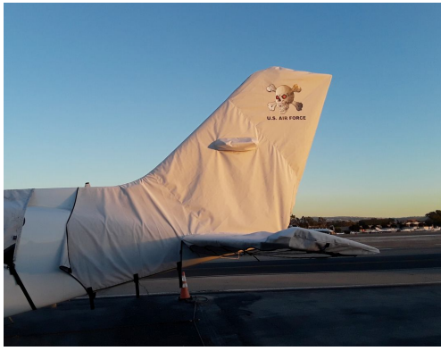
Cessna 421 Empennage Cover