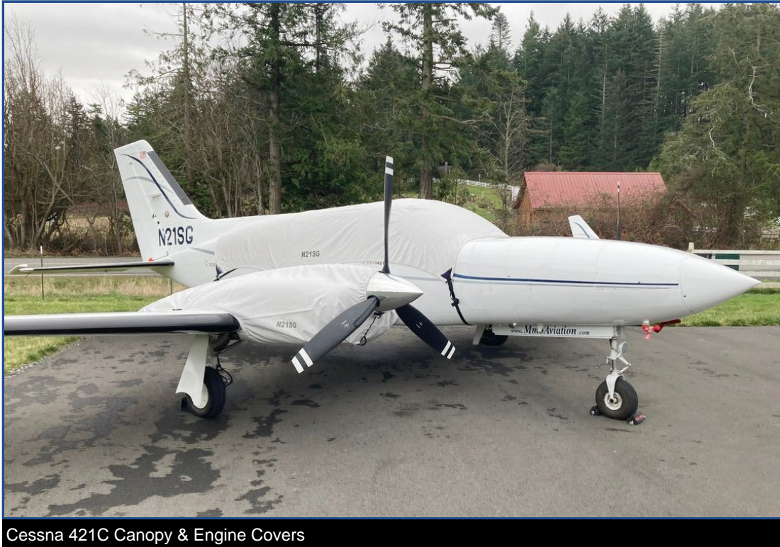
Cessna 421C Canopy & Engine Covers