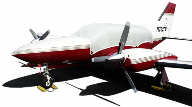
Cessna 421C Canopy Cover & Engine Plugs

Travel Covers are made with Silver Solution-Dyed Polyester fabric and only lined over the windshield to save weight. The material is lightweight and more compact for easy stowage in the aircraft. The polyester material is water resistant, but only intended for occasional use outside. We also have an ultra lightweight material available for fitted hangar dust covers. For daily outdoor use, the non-travel Sunbrella Cover is the best choice.