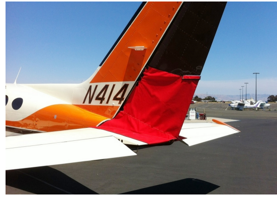
Cessna 414 Rudder Openings Cover (bird barrier)