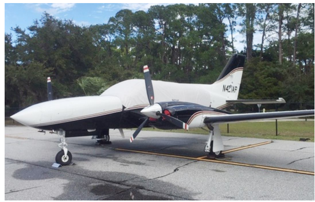
Cessna 421 Canopy Cover, Engine Plugs