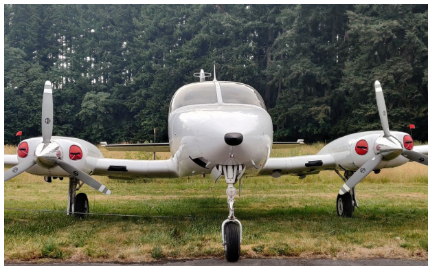
Cessna 340 Engine Plugs

Engine Inlet Plugs are custom fit for your Cessna 401 intakes, made with heavy-duty vinyl material, and stuffed with a single block of sculpted urethane foam. Each plug has a zipper that allows the foam to be removed and dried if necessary. Engine plugs have warning flags that are visible from the cockpit or 'remove before flight' streamers sewn onto the face of the plugs. Most plugs are imprinted with the aircraft registration number in black for an extra charge. Storage bag NOT included. Engine plugs may be inserted after flight when the engine is still warm. Engine Inlet Plugs are commonly referred to as Cowl Plugs, Intake Plugs, Cowl Blocks, Engine Blocks, and Engine Bungs.