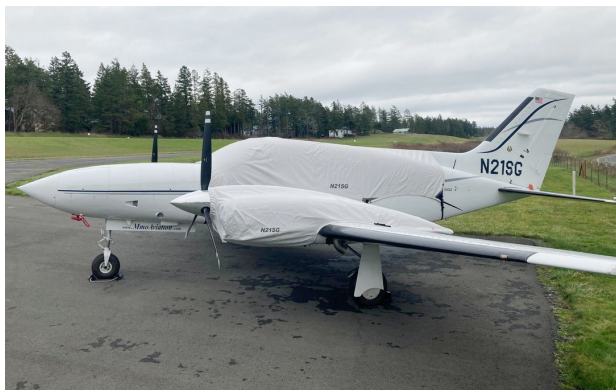
Cessna 421C Canopy & Engine Covers