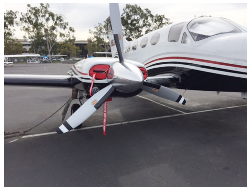
Cessna 414 Engine Inlet Plugs