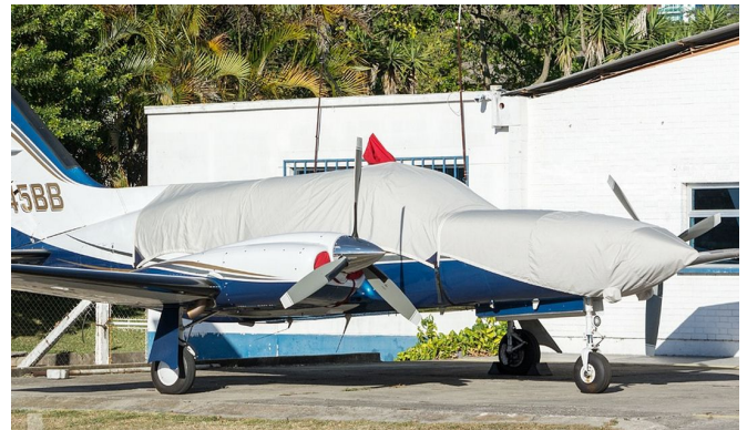
Cessna 421 Canopy Cover & Nose Cover