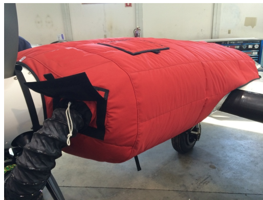
Cessna 402 Insulated Engine Cover with Heater