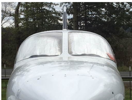
Cessna 421 Windshield HeatShields