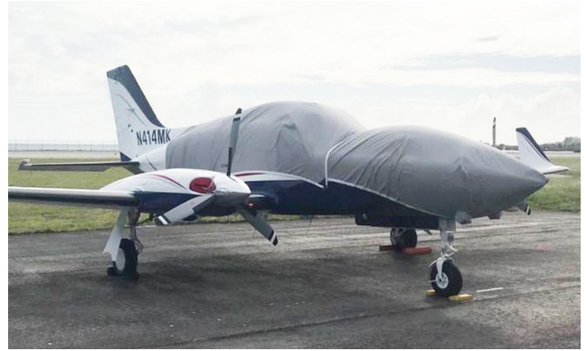
Cessna 414 Travel Cover, Light Weight Canopy Cover