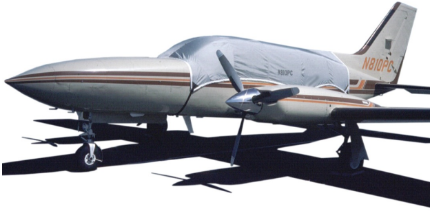
Cessna 421 Cockpit/Windshield Cover

non-travel Sunbrella Cover is the best choice.