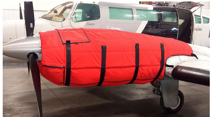
Cessna 404 Insulated Engine Cover