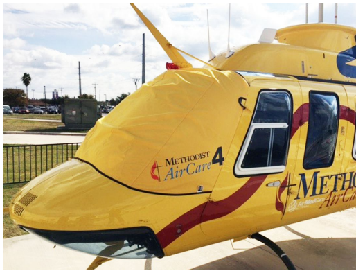
Yellow Windshield Cover with artwork

Travel Covers are made with Silver Solution-Dyed Polyester fabric and fully lined over the entire cover. The material is lightweight and more compact for easy stowage in the aircraft. The polyester material is water resistant, but only intended for occasional use outside. We also have an ultra lightweight material available for fitted hangar dust covers. For daily outdoor use, the non-travel Sunbrella Cover is the best choice.