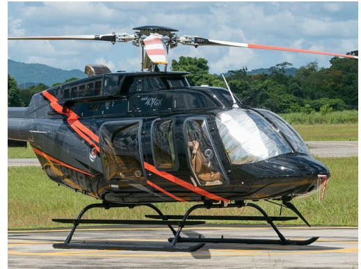
Bell 407 Windshield Heatshields