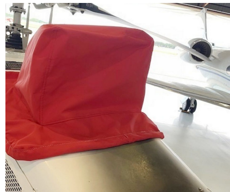
Bell 407 Exhaust/Gap Cover (weighted)