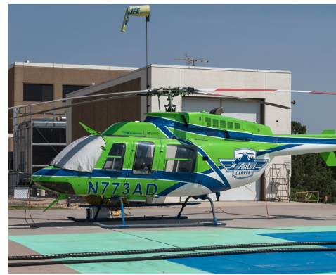
Bell 407 Windshield Cover