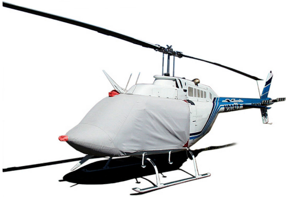
JetRanger Bubble Cover

This cover type is made from Silver Acrylic Sunbrella canvas and is 100% lined with a soft and smooth microfiber. Bruce's Custom Covers developed this material combination especially for aircraft protection. The outer material is medium weight and treated for water resistance, UV resistance and anti-static buildup. The inner lining is a very soft and smooth microfiber to prevent scratching. The material is very reflective, and tests show that the cabin interior temperature can be reduced to near-ambient temperature on the hottest of days. It is water, ice and snow repellent, yet breathable to allow moisture to escape from between the cover and the aircraft surface.