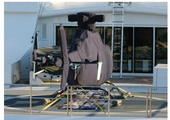
Bell 407 Complete Cover Set