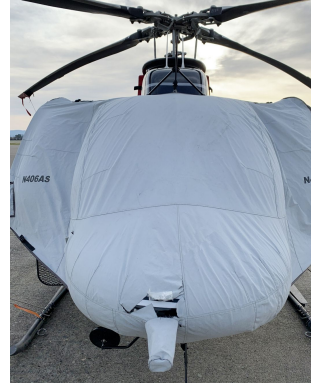
Bell 407 Travel Cover, Abbreviated Bubble Cover, Secures To Doors