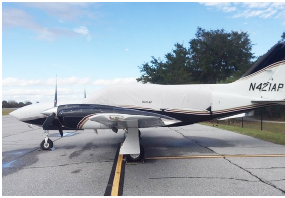
Cessna 421 Canopy Cover