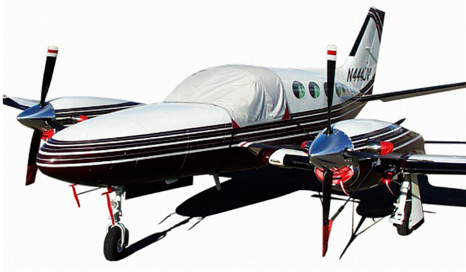
Cessna 425 Cockpit Cover