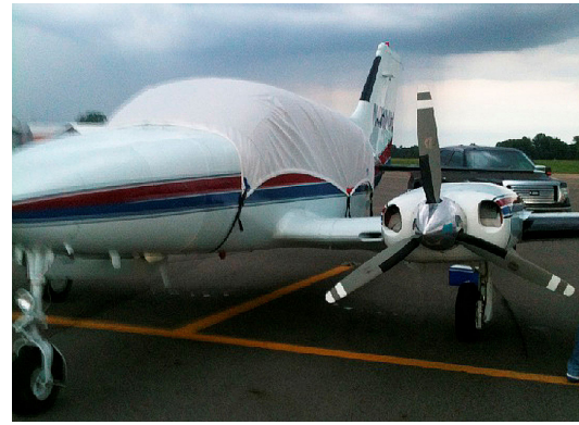
Cessna 401B Canopy Cover