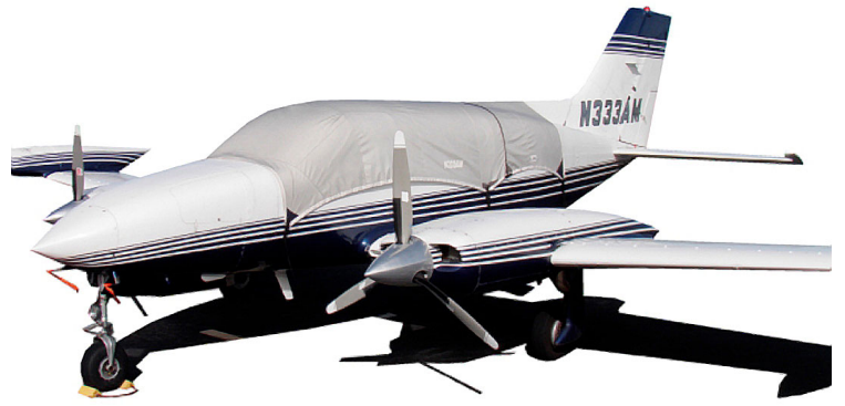
Cessna 414 Canopy Cover & Pitot Covers