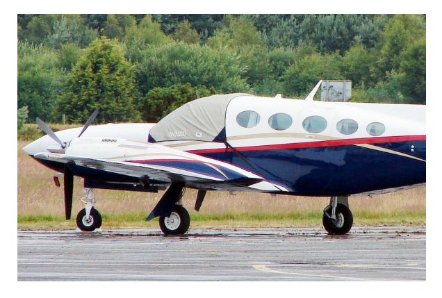
Cessna 421 Cockpit Cover

This cover type is made from Silver Acrylic Sunbrella canvas and is 100% lined with a soft and smooth microfiber. Bruce's Custom Covers developed this material combination especially for aircraft protection. The outer material is medium weight and treated for water resistance, UV resistance and anti-static buildup. The inner lining is a very soft and smooth microfiber to prevent scratching. The material is very reflective, and tests show that the cabin interior temperature can be reduced to near-ambient temperature on the hottest of days. It is water, ice and snow repellent, yet breathable to allow moisture to escape from between the cover and the aircraft surface.