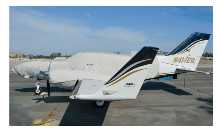
Cessna 414A Extended Canopy/Nose Cover & Engine Covers