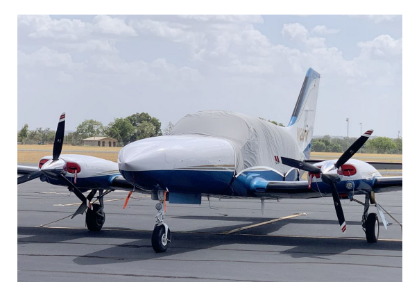
Cessna 414 Travel Weight Canopy Cover, Engine Plugs