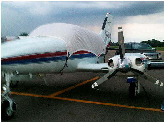
Cessna 401B Canopy Cover

Travel Covers are made with Silver Solution-Dyed Polyester fabric and only lined over the windshield to save weight. The material is lightweight and more compact for easy stowage in the aircraft. The polyester material is water resistant, but only intended for occasional use outside. We also have an ultra lightweight material available for fitted hangar dust covers. For daily outdoor use, the non-travel Sunbrella Cover is the best choice.