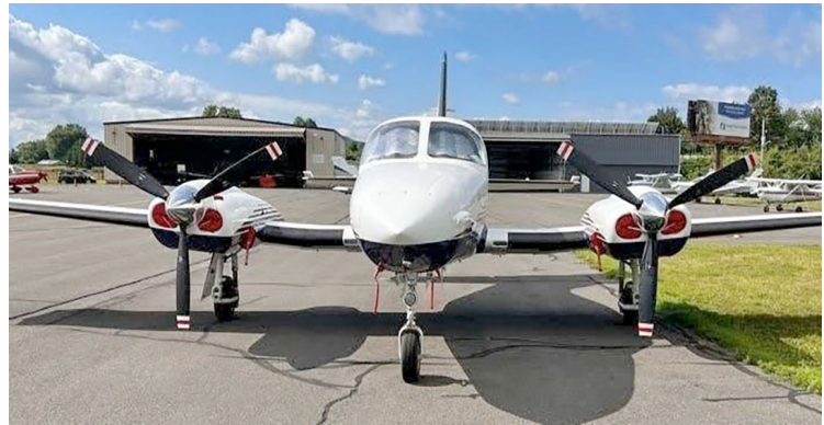
Cessna 421 Engine Plugs