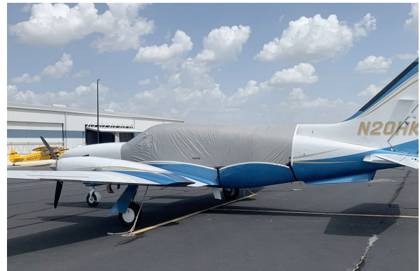
Cessna 414 Travel Weight Canopy Cover