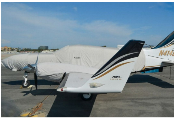
Cessna 414 Extended Canopy/Nose Cover, Engine Covers

This cover type is made from Silver Acrylic Sunbrella canvas and is 100% lined with a soft and smooth microfiber. Bruce's Custom Covers developed this material combination especially for aircraft protection. The outer material is medium weight and treated for water resistance, UV resistance and anti-static buildup. The inner lining is a very soft and smooth microfiber to prevent scratching. The material is very reflective, and tests show that the cabin interior temperature can be reduced to near-ambient temperature on the hottest of days. It is water, ice and snow repellent, yet breathable to allow moisture to escape from between the cover and the aircraft surface.