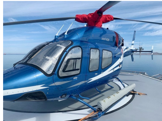
Bell 429 Rotor Hub Cover, Cockpit & Cabin HeatShields