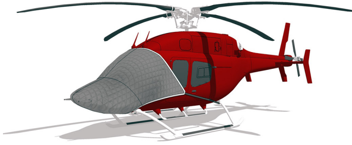
Bell 429 Insulated Cockpit/Nose Cover