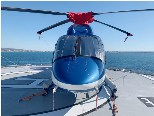
Bell 429 Windshield HeatShields, Rotor Mast Cover

Cockpit Heatshields are interior sunshades for the aircraft's cockpit. The product is a unique composite of closed-cell foam with a silver mylar finish. The semi-rigid design is stiff enough to stand inside the window framing. Darts and folds are incorporated into the material so that it conforms to the complex shape of the helicopter windows. The set folds up flat and is easily stored in the included storage sleeve. Some designs may require velcro and suction cups. A Heatshield is an excellent short-term remedy for cockpit overheating, but an external fabric cover is more effective for long-term protection.