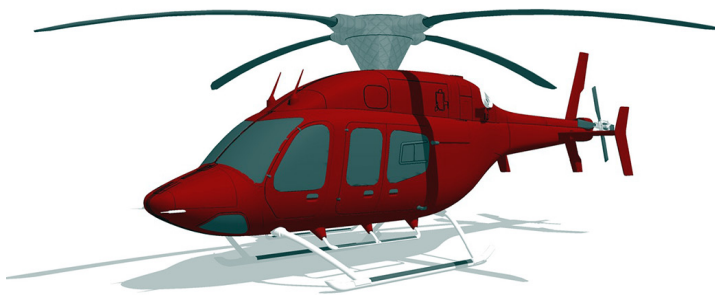
Bell 429 Insulated Main Rotor Hub Cover

WINTER USE MATERIAL - Made with Solution-Dyed Polyester fabric, this option is intended for seasonal use to aid in deicing, rain mitigation, or for occasional travel. The material is lighter and more compact, but more susceptible to UV damage and may have a shorter useful life if used continuously outside than the all-year use material.