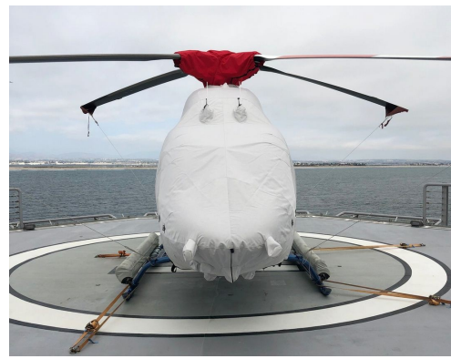
Bell 429 Main Body Cover, Rotor Hub & Tail Rotor Covers