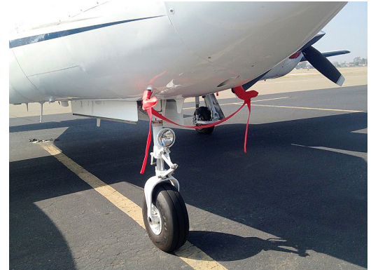
Cessna 421 Pitot Covers set