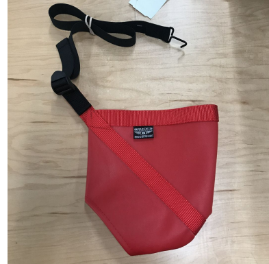
Casa 212 Insulated Engine & Propellor/Spinner Covers Prop Tie-Down, Various Models (secures with a hook to engine nacelle)