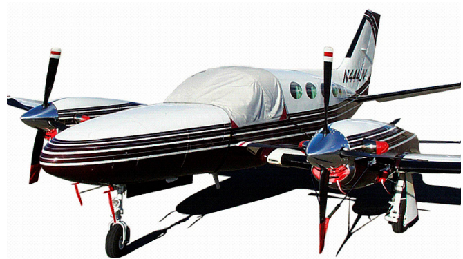
Cessna 425 Cockpit Cover