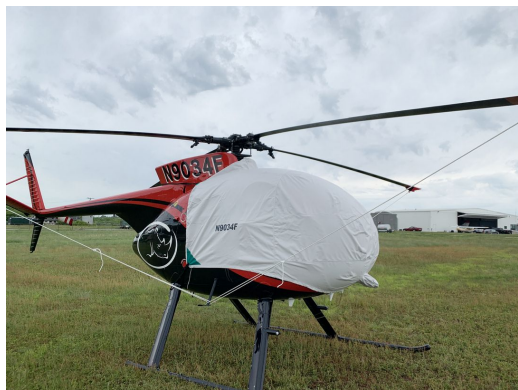
Hughes 500C Bubble Cover with Intake Add-On