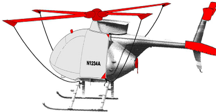
Full Cover Set

The Tailboom Cover details vary by model, but generally the helicopter tail boom cover encloses the tail boom from the "bottleneck" to the aft end. They usually also cover the horizontal stabilizers, and are custom made to allow for antennae, lights, and other protrusions. They attach with straps underneath the tail boom. Covers for the vertical and horizontal stabilizers are also available separately. Specific information for each model is available on request.