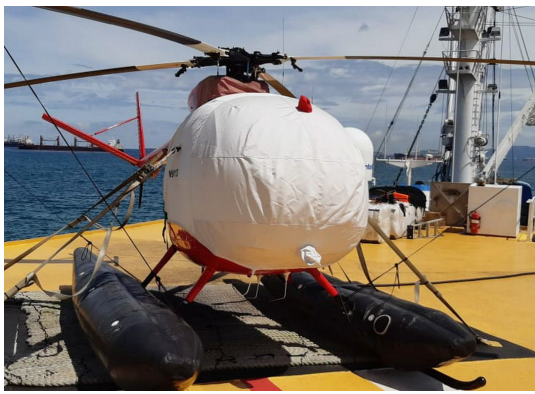
Hughes 500C (369HS) Bubble Cover