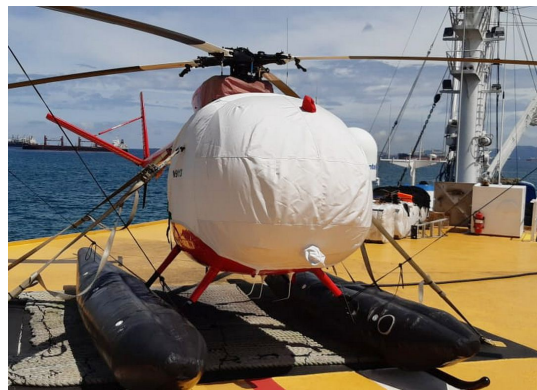
Hughes 500C (369HS) Bubble Cover