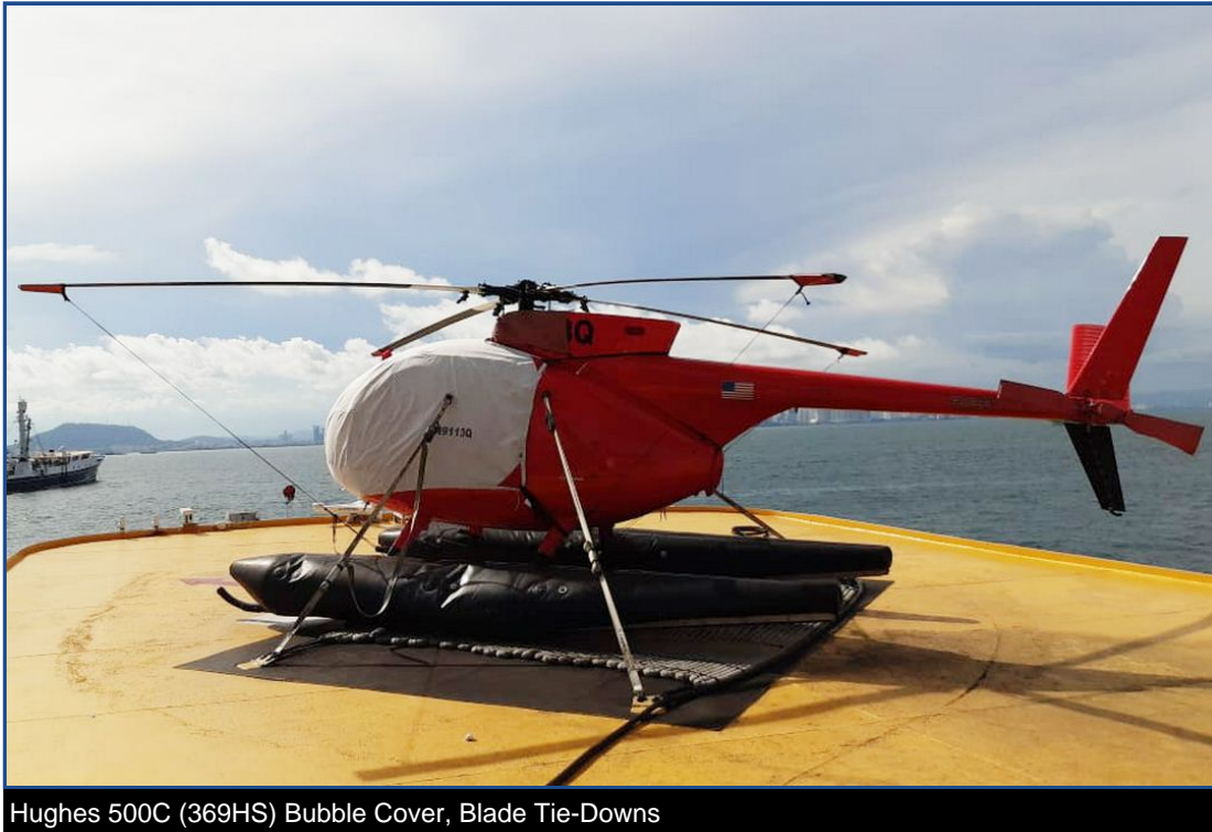
Hughes 500C (369HS) Bubble Cover, Blade Tie-Downs