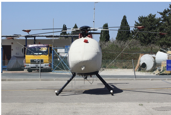
MD-500E Bubble Cover, Blade Tie-Diwns

WINTER USE MATERIAL - Made with Solution-Dyed Polyester fabric, this option is intended for seasonal use to aid in deicing, rain mitigation, or for occasional travel. The material is lighter and more compact, but more susceptible to UV damage and may have a shorter useful life if used continuously outside than the all-year use material.