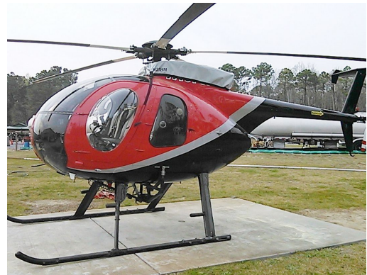
Customized Engine Cover