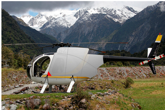
Engine Cover (illustration)

WINTER USE MATERIAL - Made with Solution-Dyed Polyester fabric, this option is intended for seasonal use to aid in deicing, rain mitigation, or for occasional travel. The material is lighter and more compact, but more susceptible to UV damage and may have a shorter useful life if used continuously outside than the all-year use material.