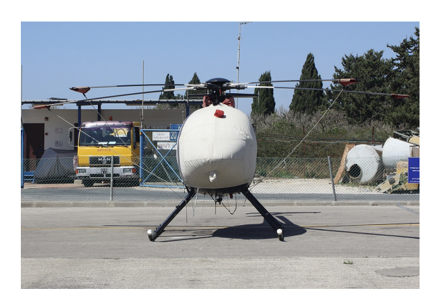
MD-500E Bubble Cover, Blade Tie-Diwns