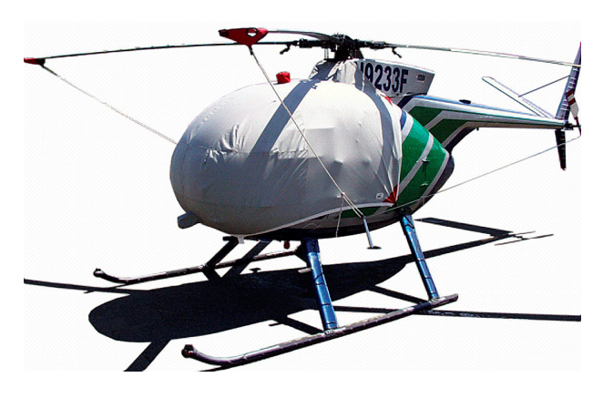
Hughes 500C Bubble Cover with Intake Add-on, Blade Tiedowns