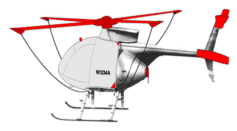
Full Cover Set

The Tailboom Cover details vary by model, but generally the helicopter tail boom cover encloses the tail boom from the "bottleneck" to the aft end. They usually also cover the horizontal stabilizers, and are custom made to allow for antennae, lights, and other protrusions. They attach with straps underneath the tail boom. Covers for the vertical and horizontal stabilizers are also available separately. Specific information for each model is available on request.