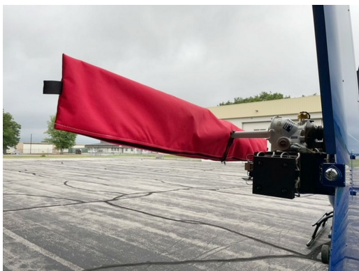
Bell 505 Jet Ranger X Tail Rotor Cover

WINTER USE MATERIAL - Made with Solution-Dyed Polyester fabric, this option is intended for seasonal use to aid in deicing, rain mitigation, or for occasional travel. The material is lighter and more compact, but more susceptible to UV damage and may have a shorter useful life if used continuously outside than the all-year use material.