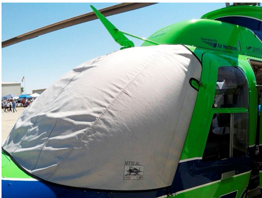
Bell 407 Windshield Cover

Travel Covers are made with Silver Solution-Dyed Polyester fabric and fully lined over the entire cover. The material is lightweight and more compact for easy storage in the aircraft. The polyester material is water resistant, but only intended for occasional use outside. We also have an ultra lightweight material available for fitted hangar dust covers. For daily outdoor use, the non-travel Sunbrella Cover is the best choice.