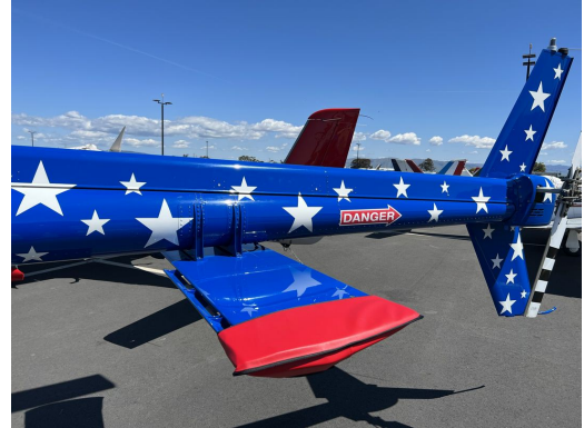
Bell 505 Horizontal Stabilizer Tip Pads