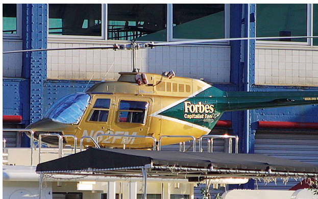
Bell 206B Jetranger Windshield HeatShields

Heatshields are interior sunshades for an aircraft's windows or canopy glass. The product is a unique composite of closed-cell foam with a silver mylar finish. The semi-rigid design is stiff enough to stand along the inside of the windshield using sun visors or window framing. It folds up flat and easily stores in the included storage sleeve. Some designs may require velcro and suction cups. A Heatshield is an excellent short-term remedy for cockpit overheating.