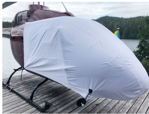
Bell 505 Bubble Cover, test fit cover