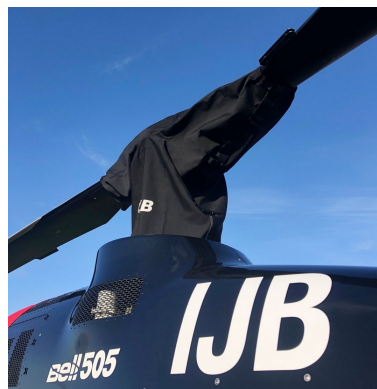
Bell 505 Rotor Mast & Blade Covers