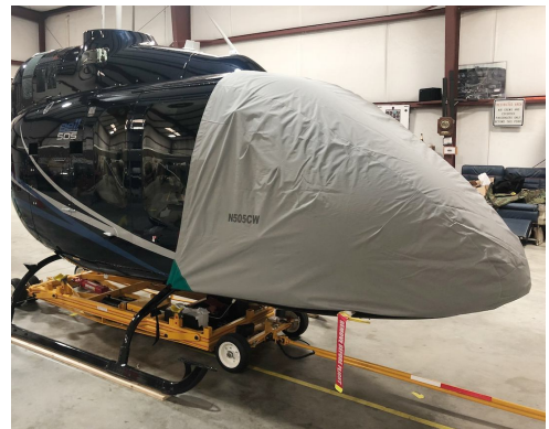
Bell 505 Bubble Cover, travel weight type