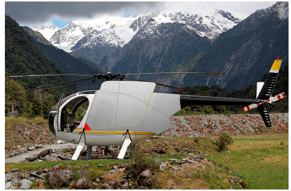
Engine Cover (illustration)