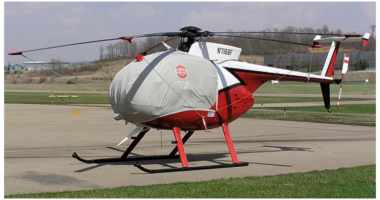
Hughes 500D Bubble Cover with Wire Strike detail and Blade Tie-downs