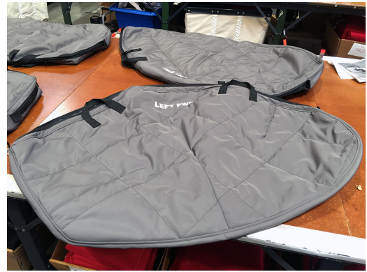
Protective Door Bags