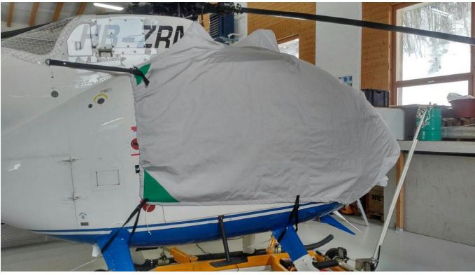
MD520 Bubble Cover with Intake Cover Add-On