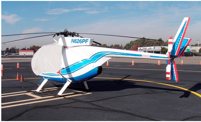
MD500C Bubble Cover with Wire Strike detail