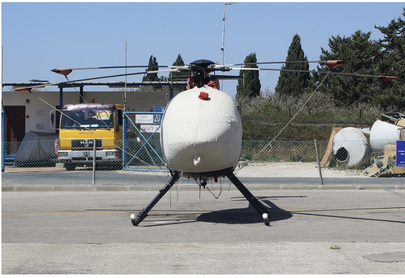
MD-500E Bubble Cover, Blade Tie-Downs