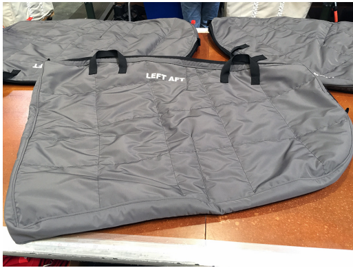
Protective Door Bags

**Padded Door Bags* are designed to provide portable protection of the doors when they are removed from the aircraft. They are padded to moderate thickness, zippered closed, and have sturdy carry handles for easy transport.