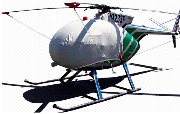
Hughes 500C Bubble Cover with Intake Add-on, Blade Tie-downs