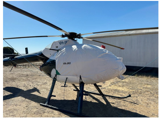
MDD 520 NOTAR Bubble Cover w/Intake Cover Add-On