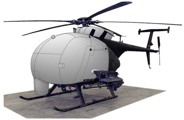
MH-6J Bubble, Flir & Doghouse Covers (illustration)