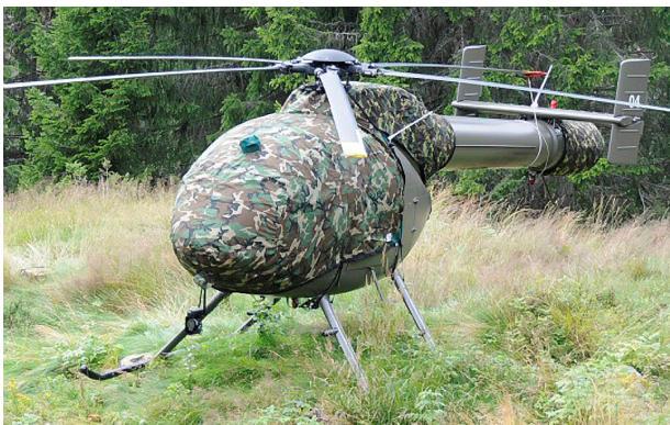
MD520 NOTAR Bubble, Engine, & NOTAR Covers & Blade Tie-downs

The Tailboom Cover details vary by model, but generally the helicopter tail boom cover encloses the tail boom from the "bottleneck" to the aft end. They usually also cover the horizontal stabilizers, and are custom made to allow for antennae, lights, and other protrusions. They attach with straps underneath the tail boom. Covers for the vertical and horizontal stabilizers are also available separately. Specific information for each model is available on request.