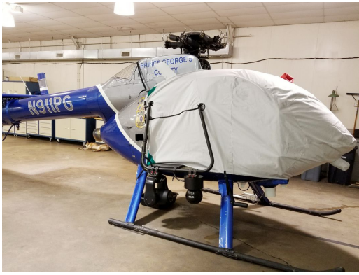
McDonnell Douglas MDD 520 Notar Bubble Cover, with special missions equipment.