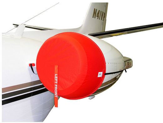
Citation Encore Intake Cover Set