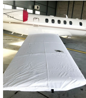
Cessna Citation CJ-4 Wing Covers, test fit cover