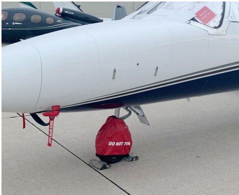
Cessna Citation Nose Tire Cover

ALL-YEAR USE MATERIAL - Made with Silver Acrylic Sunbrella canvas, the all-year use material is the best option for sun protection and cover longevity. This heavier more durable material is intended for all weather conditions, such as rain and snow or lots of sun.