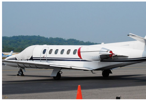
Cessna Citation S2 Cockpit Cover, Intake Covers & Exhaust Plugs