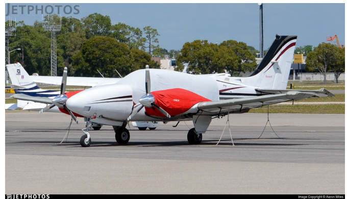
Beech Baron 58, G58 Canopy Cover, Insulated Engine Covers