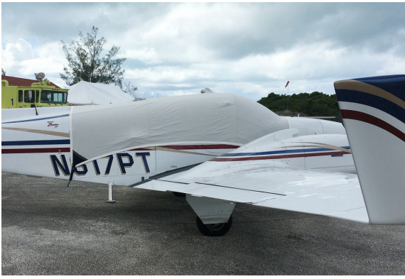
Beech Baron 58 Canopy Cover