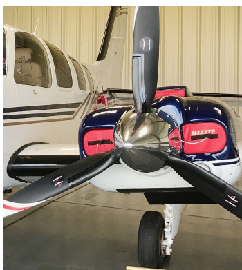
Beech Baron 58 Engine Inlet Plugs & Cowl Top Plug

Engine Inlet Plugs are custom fit for your Beech Baron 58P intakes, made with heavy-duty vinyl material, and stuffed with a single block of sculpted urethane foam. Each plug has a zipper that allows the foam to be removed and dried if necessary. Engine plugs have warning flags that are visible from the cockpit or 'remove before flight' streamers sewn onto the face of the plugs. Most plugs are imprinted with the aircraft registration number in black for an extra charge. Storage bag NOT included. Engine plugs may be inserted after flight when the engine is still warm. Engine Inlet Plugs are commonly referred to as Cowl Plugs, Intake Plugs, Cowl Blocks, Engine Blocks, and Engine Bungs.