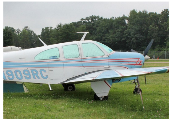
Beech Bonanza/Debonair HeatShield Set