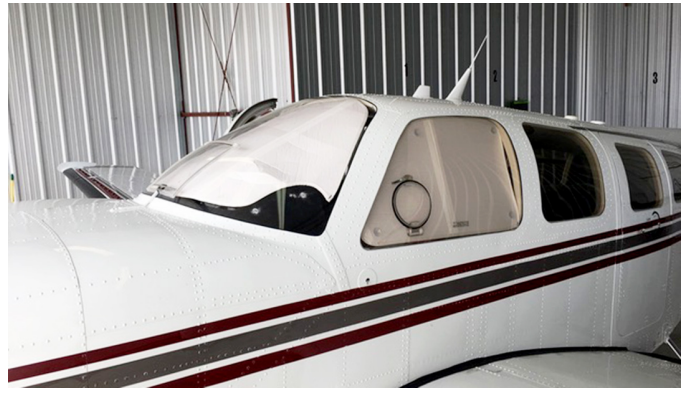
Beech Baron 58P Cockpit Heatshield Set