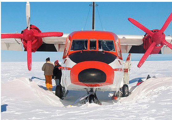
Casa 212 Insulated Engine & Propellor/Spinner Covers

This cover type is made from Silver Acrylic Sunbrella canvas and is 100% lined with a soft and smooth microfiber. Bruce's Custom Covers developed this material combination especially for aircraft protection. The outer material is medium weight and treated for water resistance, UV resistance and anti-static buildup. The inner lining is a very soft and smooth microfiber to prevent scratching. The material is very reflective, and tests show that the cabin interior temperature can be reduced to near-ambient temperature on the hottest of days. It is water, ice and snow repellent, yet breathable to allow moisture to escape from between the cover and the aircraft surface.