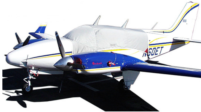
Standard Canopy Cover & Engine Plugs

Travel Covers are made with Silver Solution-Dyed Polyester fabric and only lined over the windshield to save weight. The material is lightweight and more compact for easy stowage in the aircraft. The polyester material is water resistant, but only intended for occasional use outside. We also have an ultra lightweight material available for fitted hangar dust covers. For daily outdoor use, the non-travel Sunbrella Cover is the best choice.