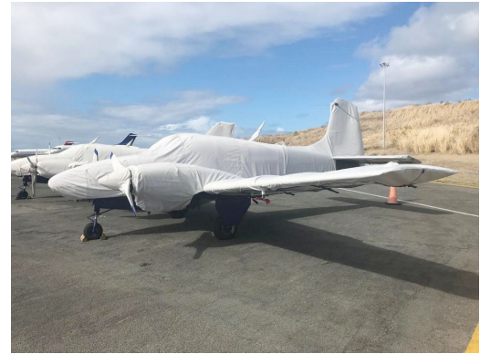
Beech Travel Air Full Cover Set