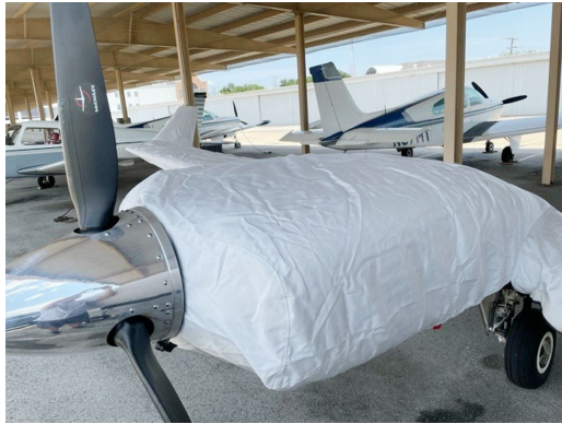
Beech Baron 58P Wing/Engine Covers (test fit)

WINTER USE MATERIAL - Made with Solution-Dyed Polyester fabric, this option is intended for seasonal use to aid in deicing, rain mitigation, or for occasional travel. The material is lighter and more compact, but more susceptible to UV damage and may have a shorter useful life if used continuously outside than the all-year use material.