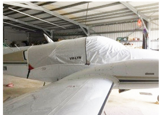
Beech Baron B-55 Canopy Cover