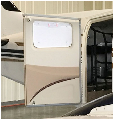
Beech Baron 58 Cabin HeatShield