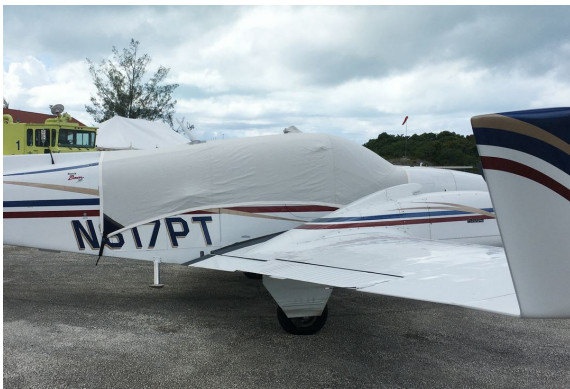
Beech Baron 58 Canopy Cover

This cover type is made from Silver Acrylic Sunbrella canvas and is 100% lined with a soft and smooth microfiber. Bruce's Custom Covers developed this material combination especially for aircraft protection. The outer material is medium weight and treated for water resistance, UV resistance and anti-static buildup. The inner lining is a very soft and smooth microfiber to prevent scratching. The material is very reflective, and tests show that the cabin interior temperature can be reduced to near-ambient temperature on the hottest of days. It is water, ice and snow repellent, yet breathable to allow moisture to escape from between the cover and the aircraft surface.