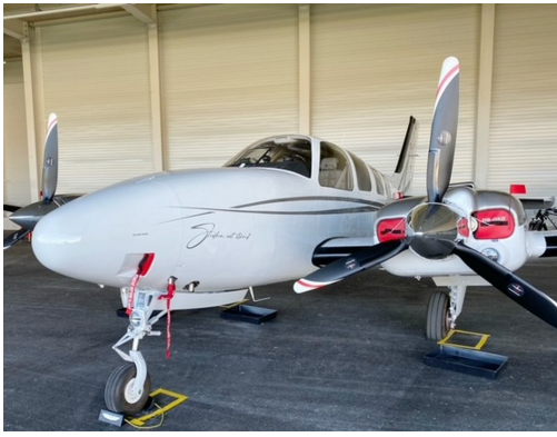
Baron G58 Fresh Air Inlet Plug (on dorsal)