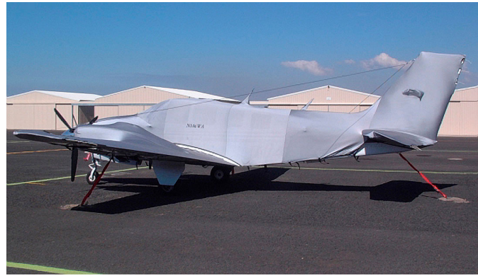
Baron FULL COVER SET, Light Weight Travel &/or Fitted Dust Cover Set