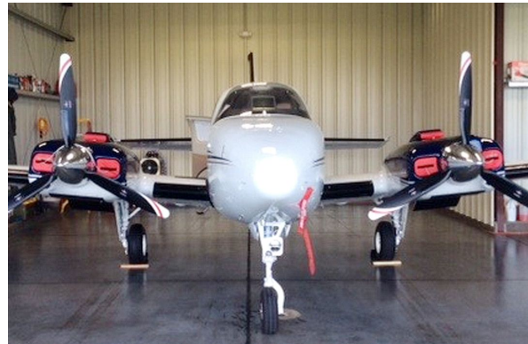
Beech Baron 58 Engine Inlet Plugs, Cowl Top Plugs, Heater Inlet, Pitot Cover