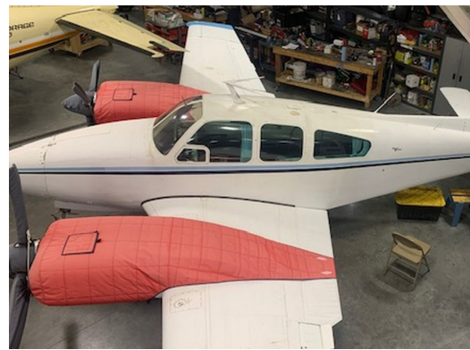
Beech Baron B55 Insulated Engine Covers