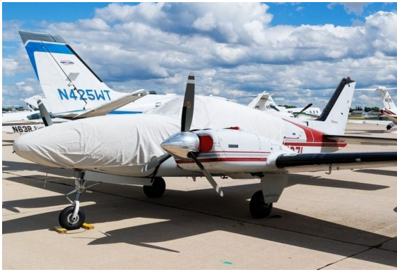
Beech Baron D55 Canopy/Nose Cover