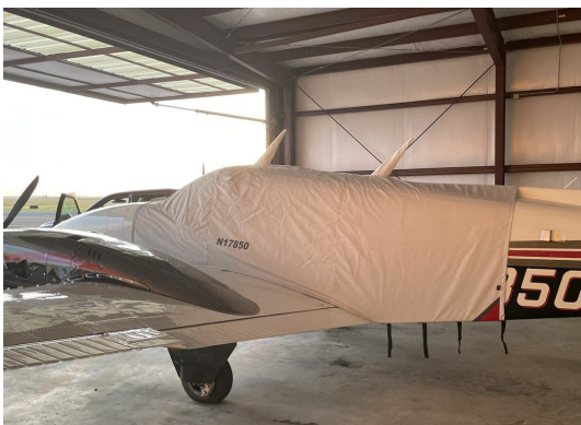
Beech Baron 58TC Extended Canopy Cover

This cover type is made from Silver Acrylic Sunbrella canvas and is 100% lined with a soft and smooth microfiber. Bruce's Custom Covers developed this material combination especially for aircraft protection. The outer material is medium weight and treated for water resistance, UV resistance and anti-static buildup. The inner lining is a very soft and smooth microfiber to prevent scratching. The material is very reflective, and tests show that the cabin interior temperature can be reduced to near-ambient temperature on the hottest of days. It is water, ice and snow repellent, yet breathable to allow moisture to escape from between the cover and the aircraft surface.