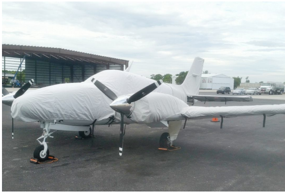
Full Cover Set (58P-020, 58P-225, 58P-405)