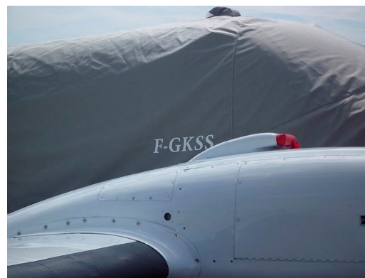
Baron Cowl Top Scoop Plugs