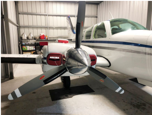
Beech Baron Engine Plugs

Engine Inlet Plugs are custom fit for your Beech Baron 58TC intakes, made with heavy-duty vinyl material, and stuffed with a single block of sculpted urethane foam. Each plug has a zipper that allows the foam to be removed and dried if necessary. Engine plugs have warning flags that are visible from the cockpit or 'remove before flight' streamers sewn onto the face of the plugs. Most plugs are imprinted with the aircraft registration number in black for an extra charge. Storage bag NOT included. Engine plugs may be inserted after flight when the engine is still warm. Engine Inlet Plugs are commonly referred to as Cowl Plugs, Intake Plugs, Cowl Blocks, Engine Blocks, and Engine Bungs.